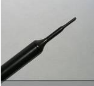
Interior of probe