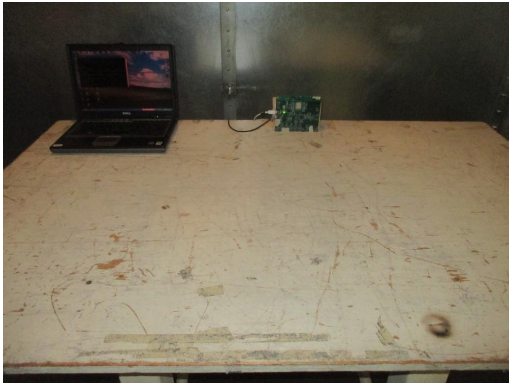
Figure 1 EUT Configuration for Radiated & Conducted Emission Tests