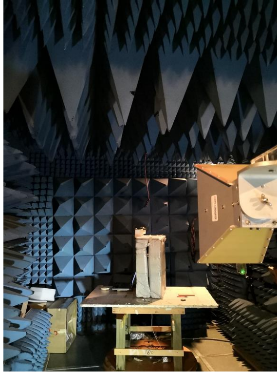
Figure 2 Radiated Emission Test Setup