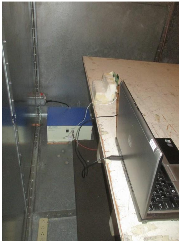
Figure 3 Conducted Emission Test Setup