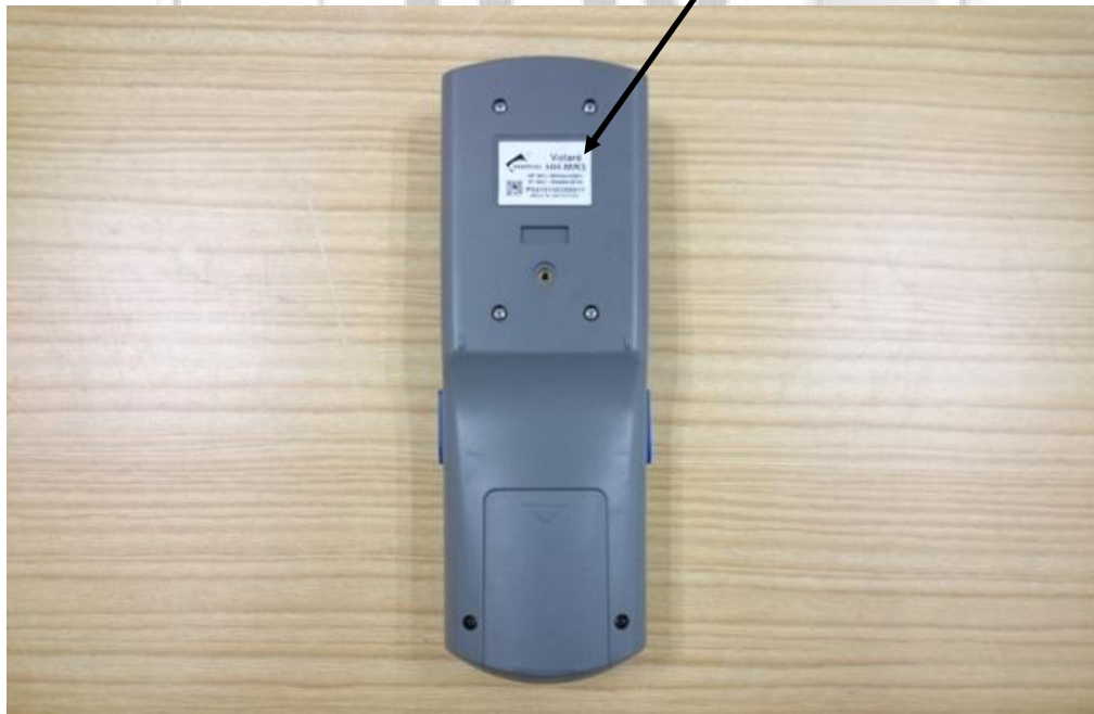
Physical Location of FCC Label on EUT