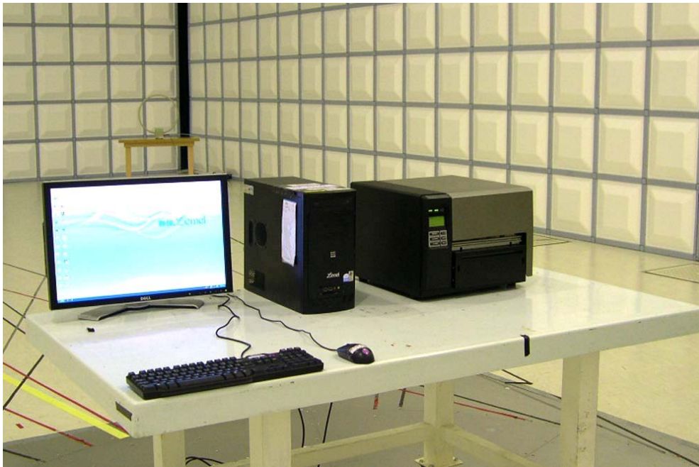
The Back View of Highest Radiated Set-up For EUT (9KHz~30MHz)