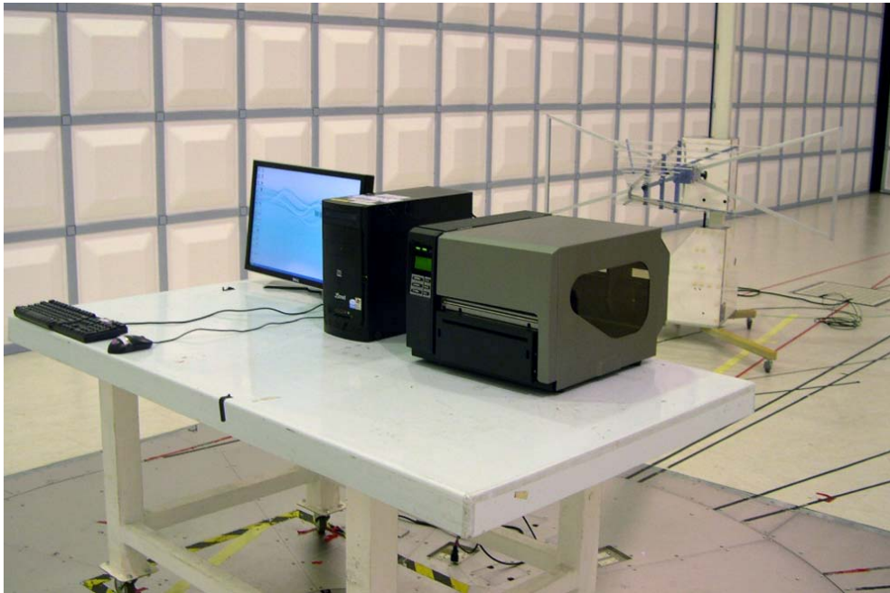
The Back View of Highest Radiated Set-up For EUT (30MHz~1GHz)