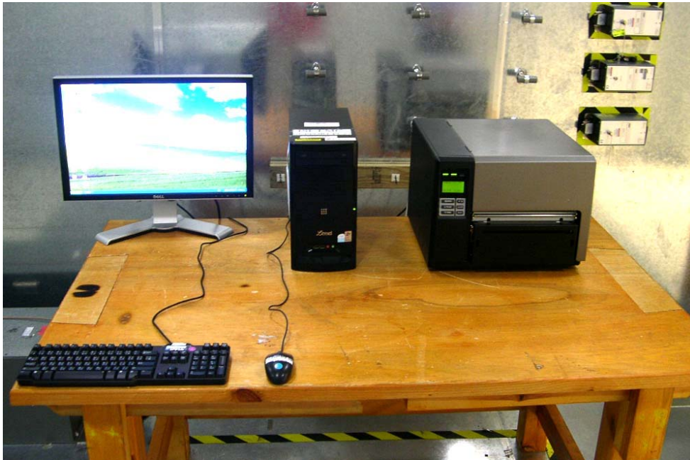
The Front View of Highest Conducted Set-up For EUT