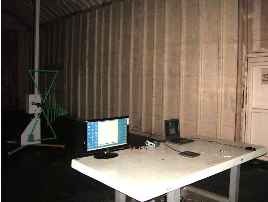
Back View of Radiated Test - (DC Charger)