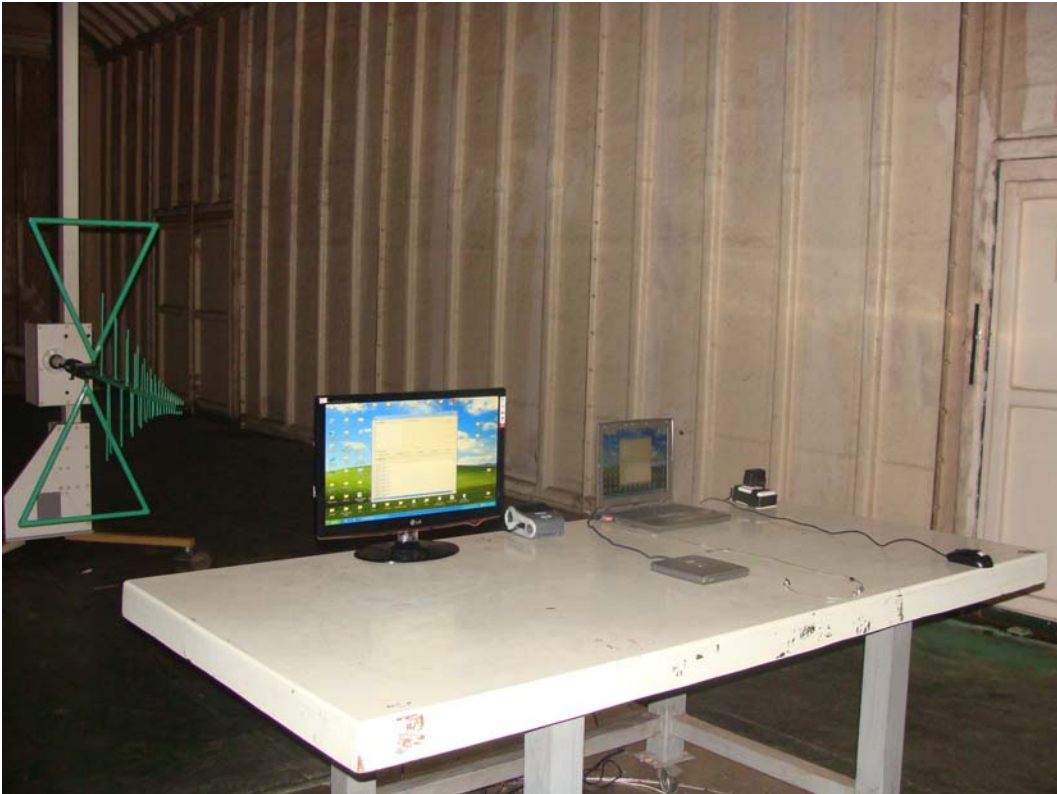
Back View of Radiated Test