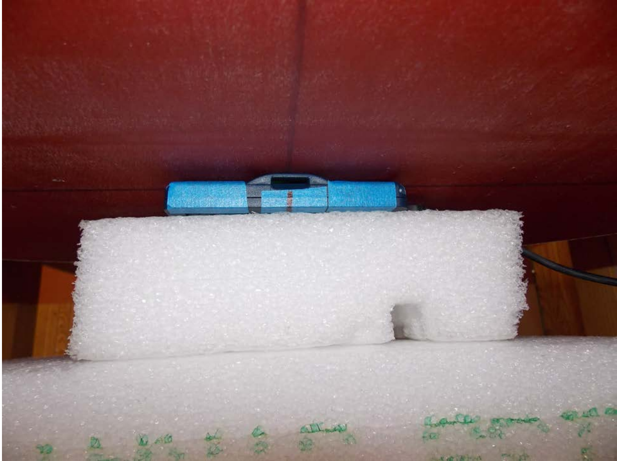
Test Position Back Body 0 mm Gap