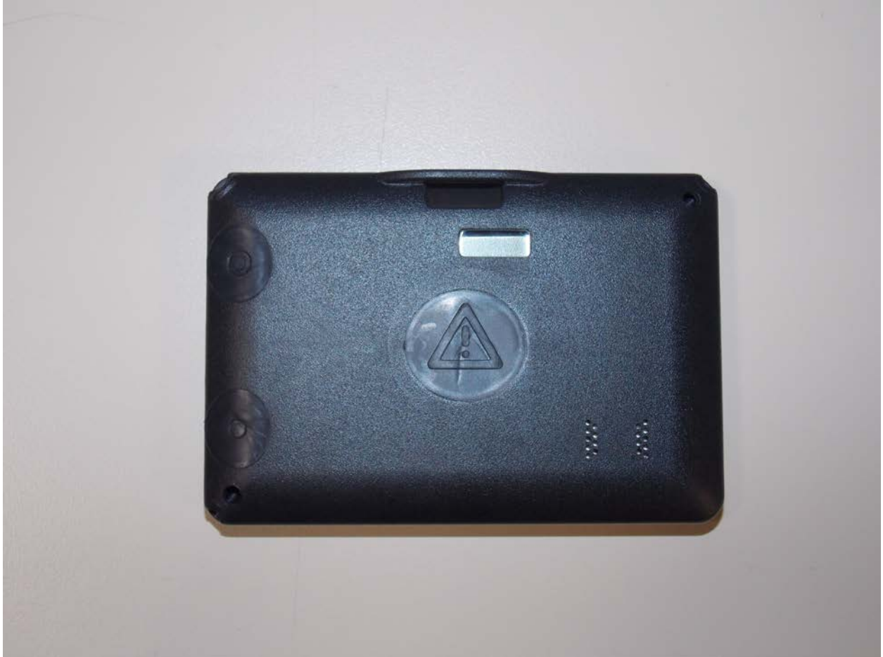
Back of Device