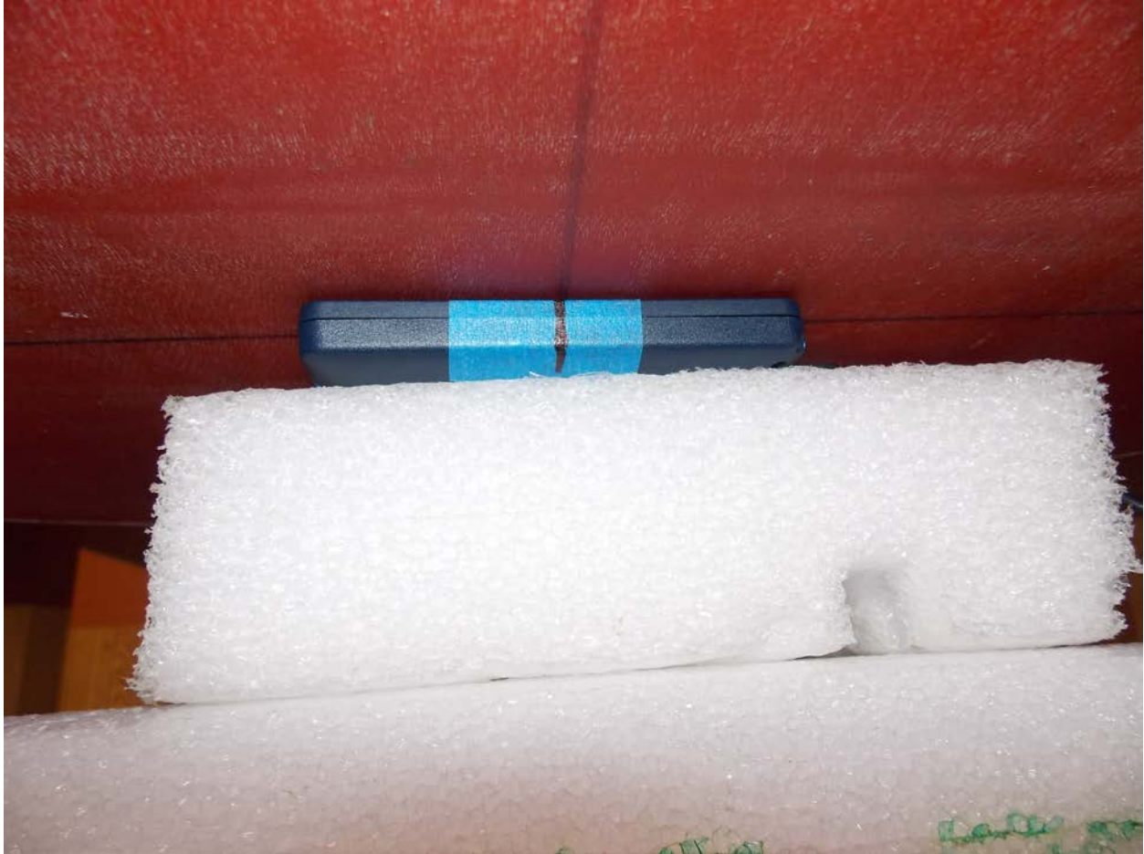
Test Position Front Body 0 mm Gap