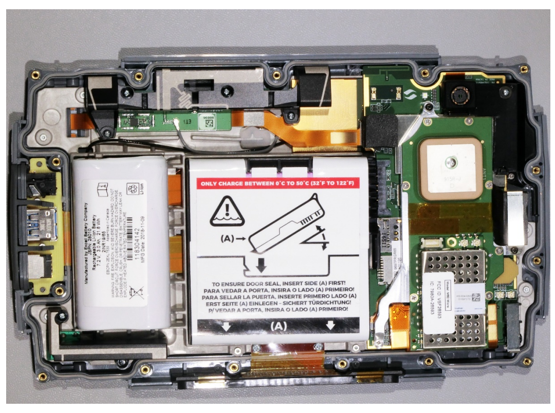
MS3 with cellular and micro RFID