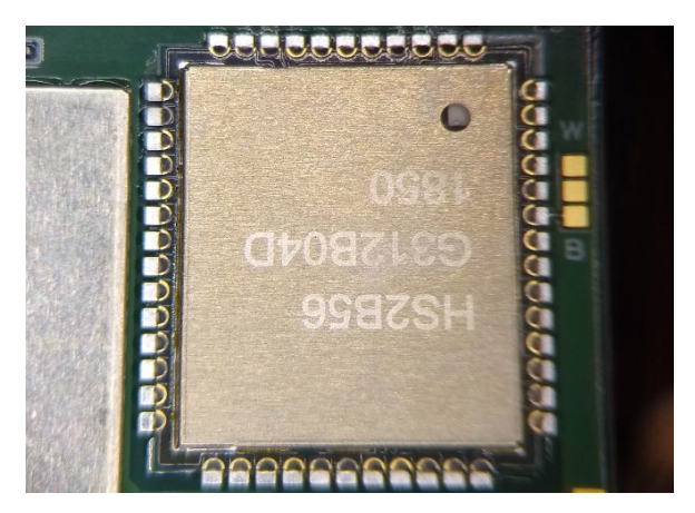
HS2B56 Bluetooth/Wi-Fi radio (top with shield)