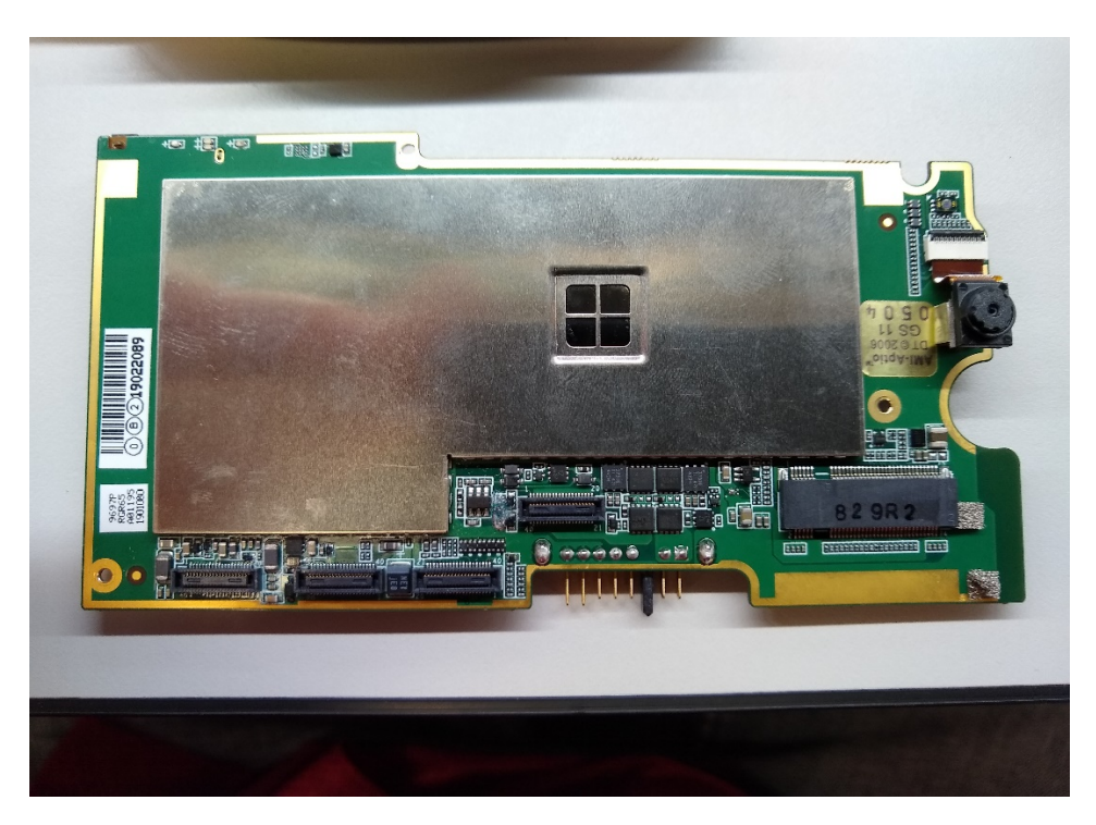
main PCBA (front) with shields