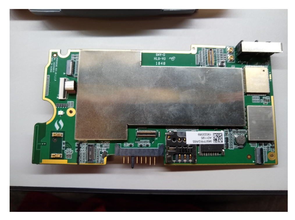
main PCBA (back) with shields