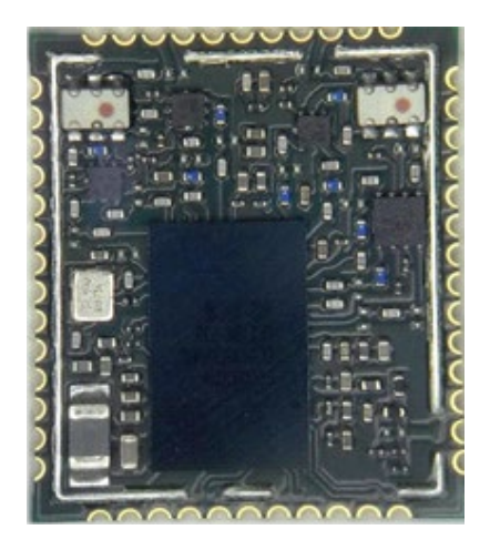
HS2B56 Bluetooth/Wi-Fi radio (without shield)