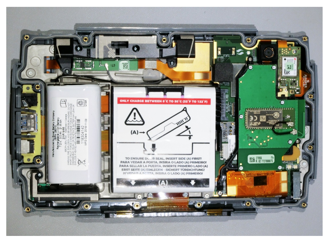
MS3 with cellular and extended range Bluetooth