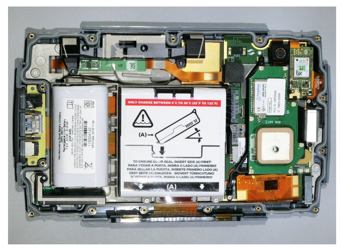
MS3 with cellular and nano RFID