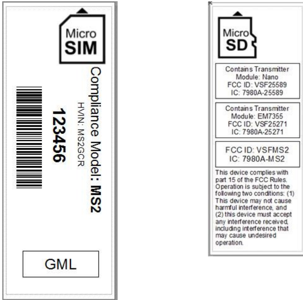
Figure 2: MS2GCR - Label