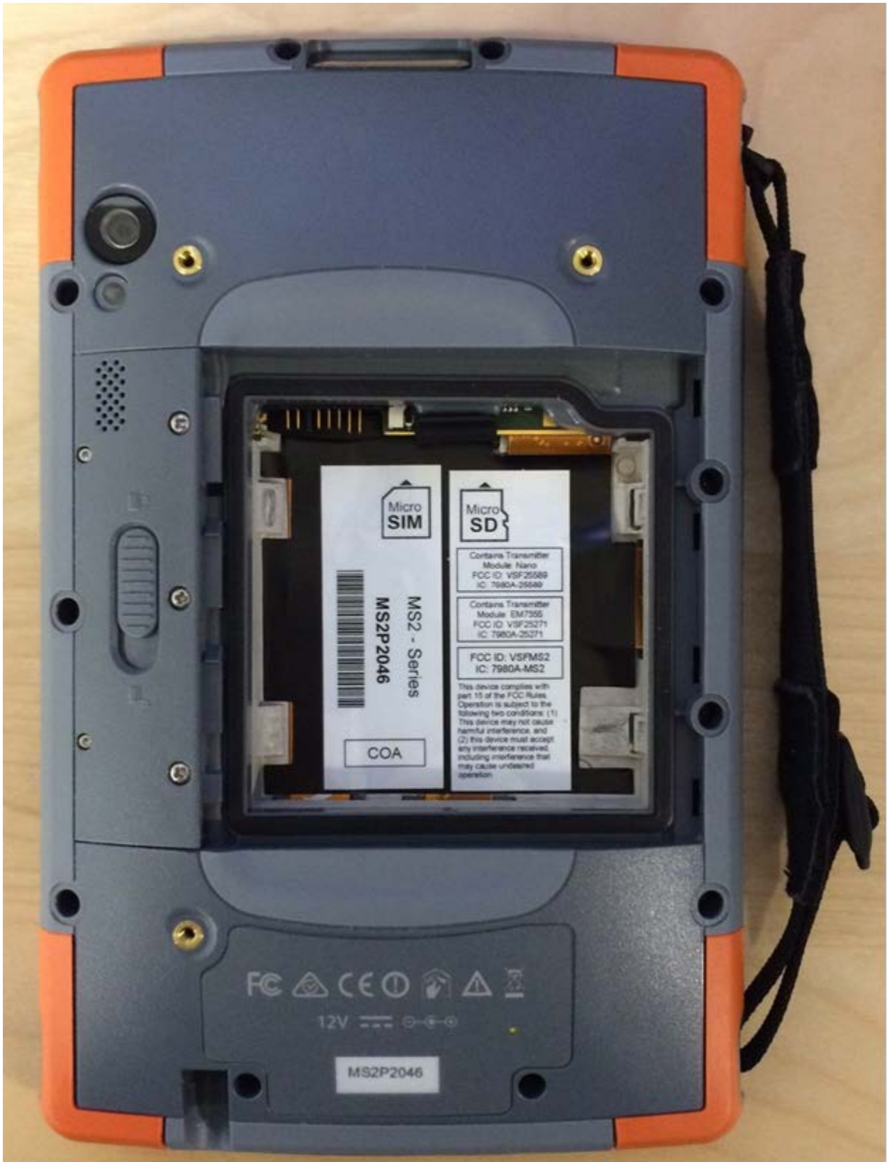
Figure 3: Sample Label Location