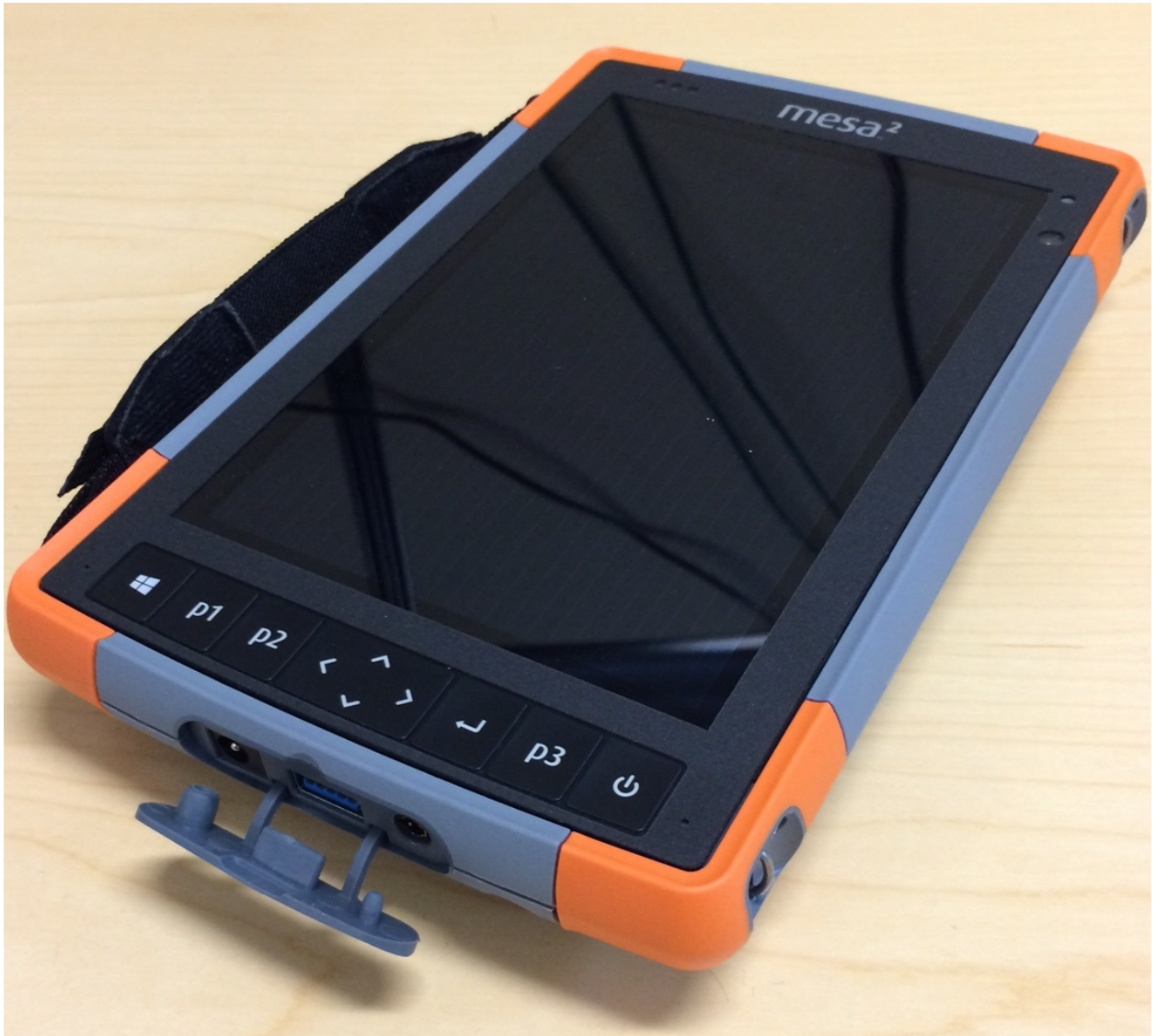
Figure 6: EUT – View 6