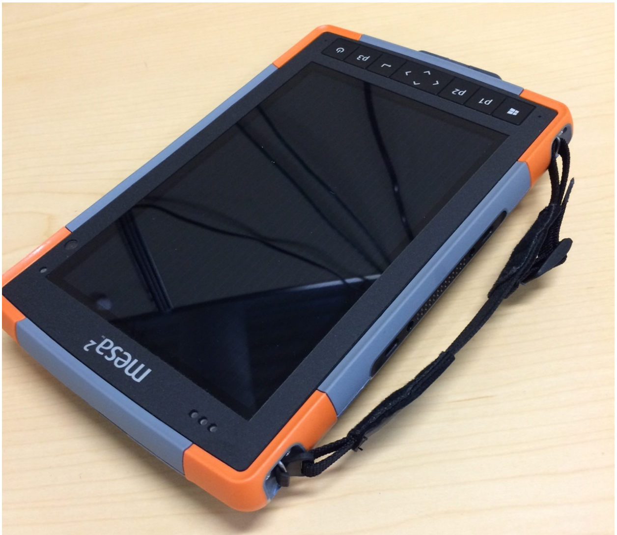
Figure 8: EUT – View 8