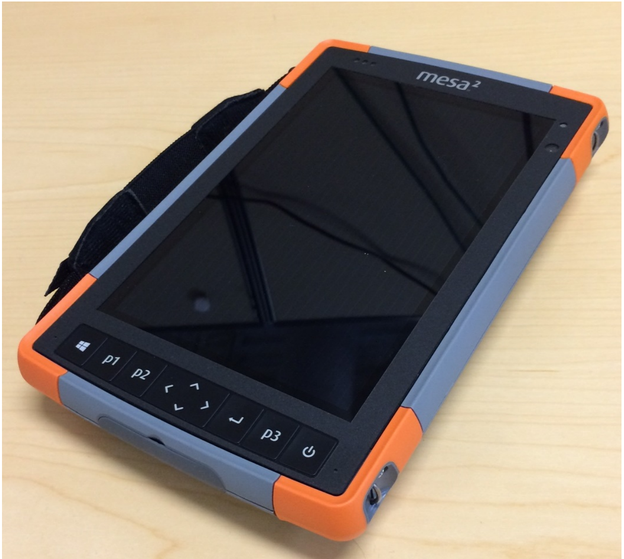
Figure 5: EUT – View 5