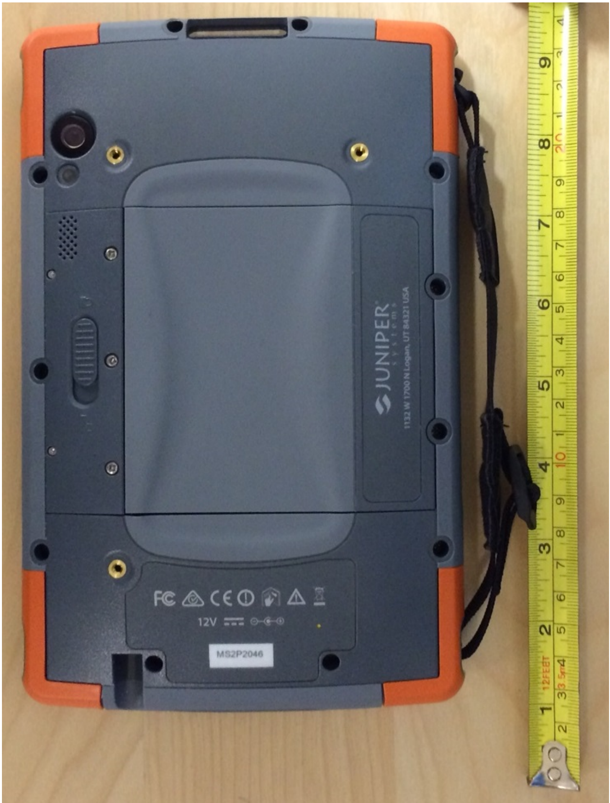
Figure 1: EUT – View 1