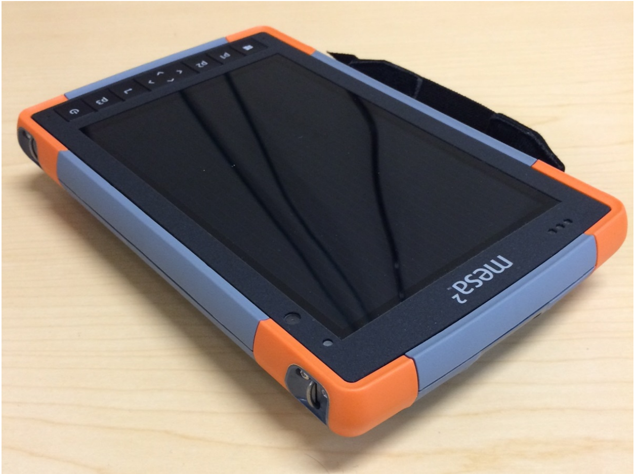
Figure 7: EUT – View 7