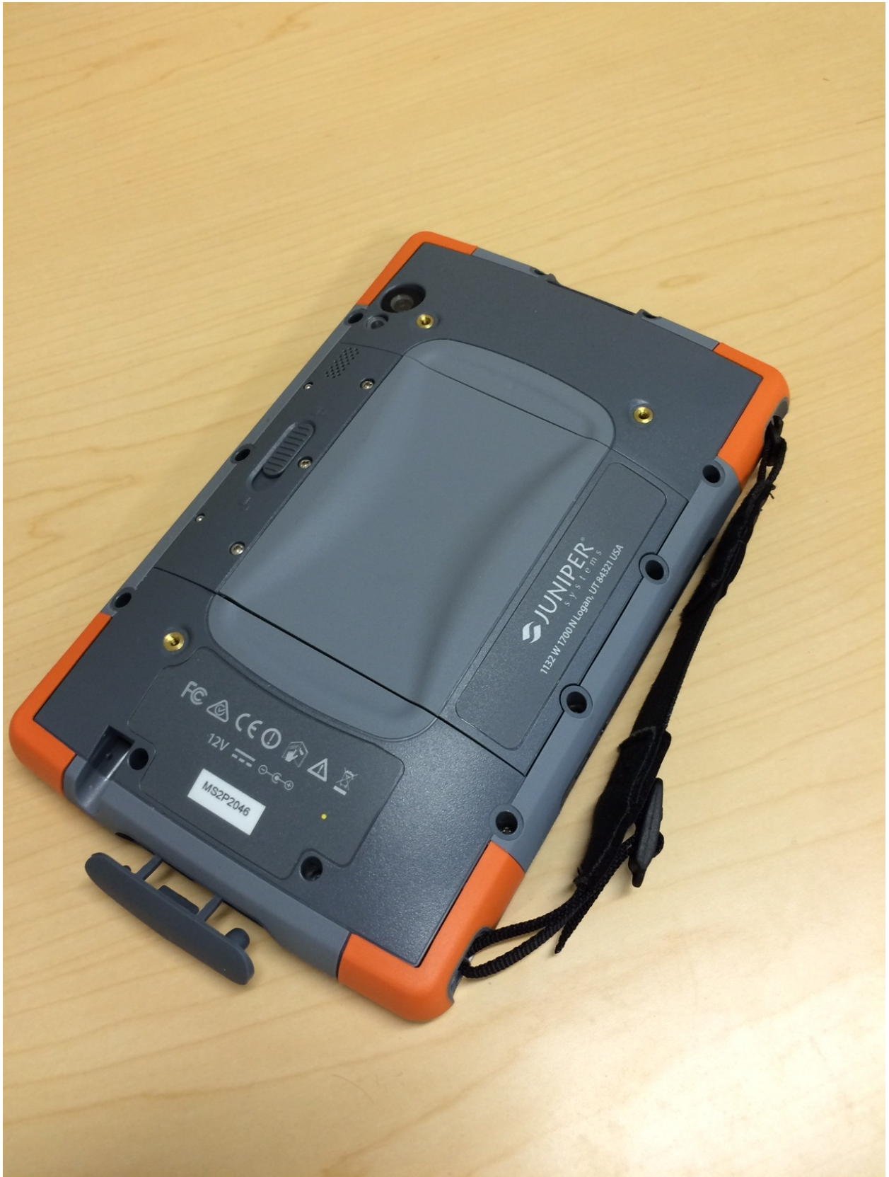
Figure 2: EUT – View 2