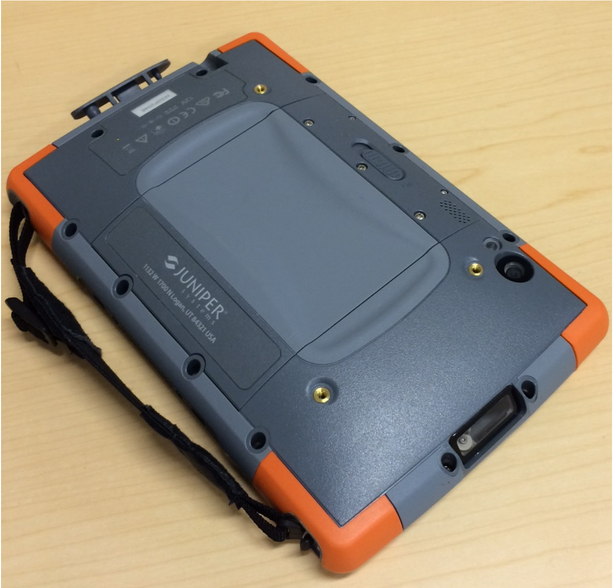
Figure 3: EUT – View 3