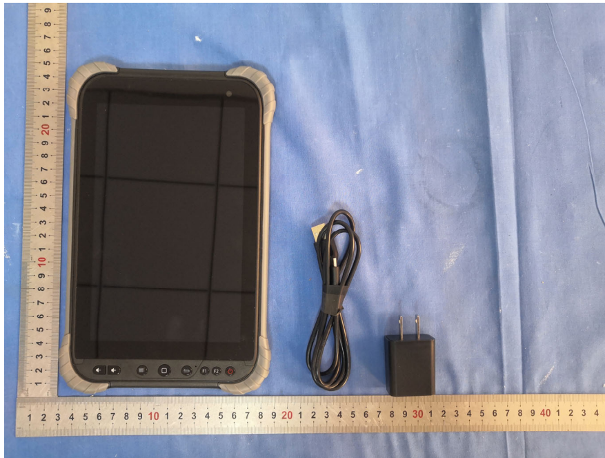
EXHIBIT A- EUT EXTERNAL PHOTOGRAPHS