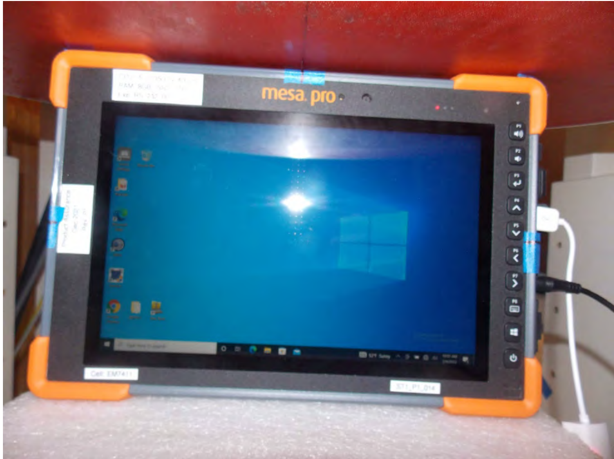
Test Position Top 0 mm Gap

Note: Cables are removed prior to testing.