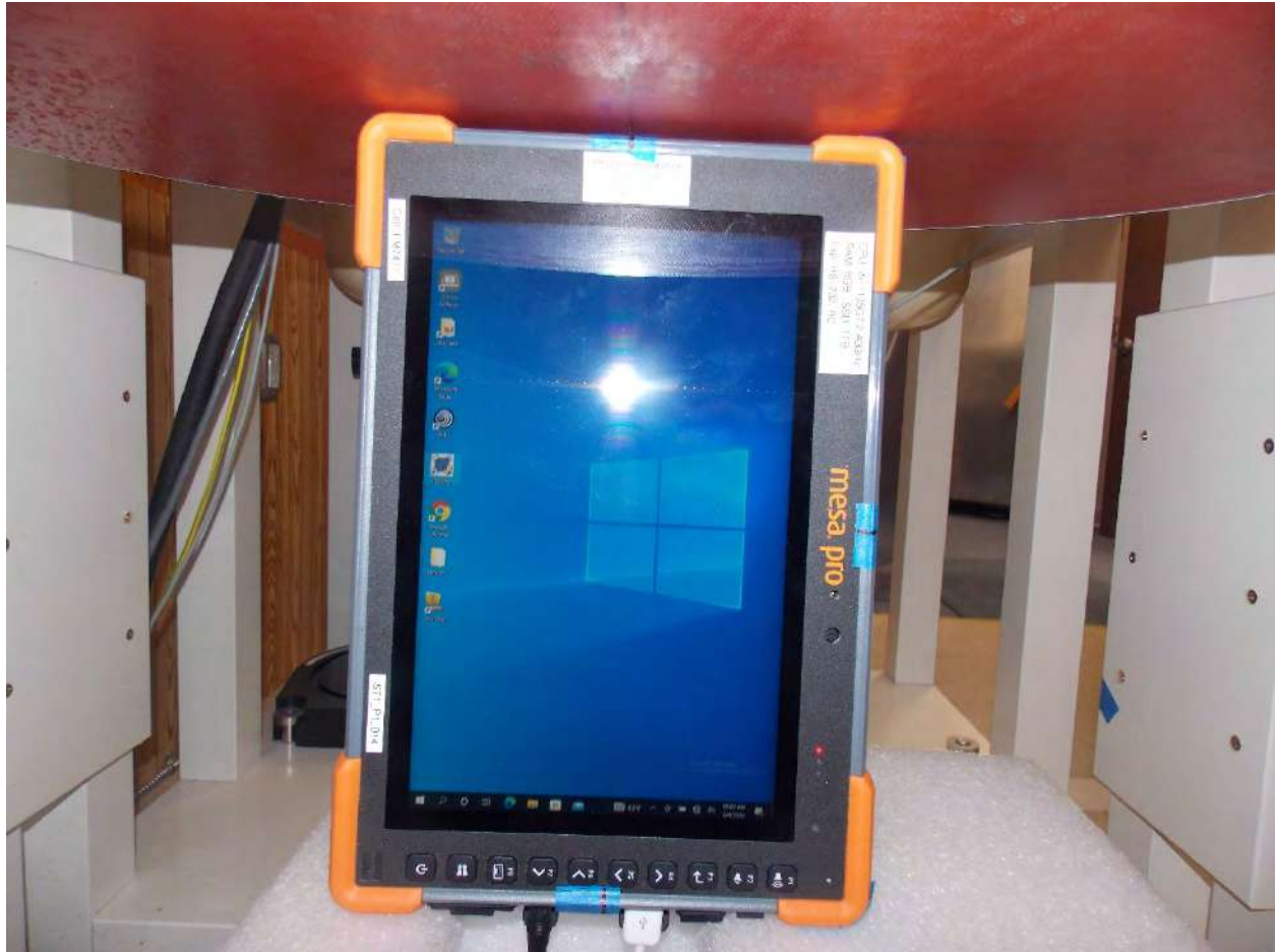
Test Position Left 0 mm Gap

Note: Cables are removed prior to testing.