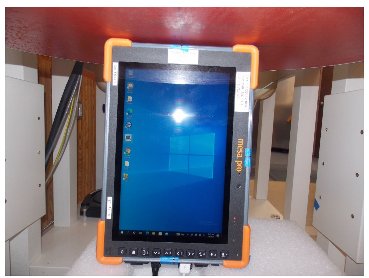
Test Position Left 0 mm Gap

Note: Cables are removed prior to testing.