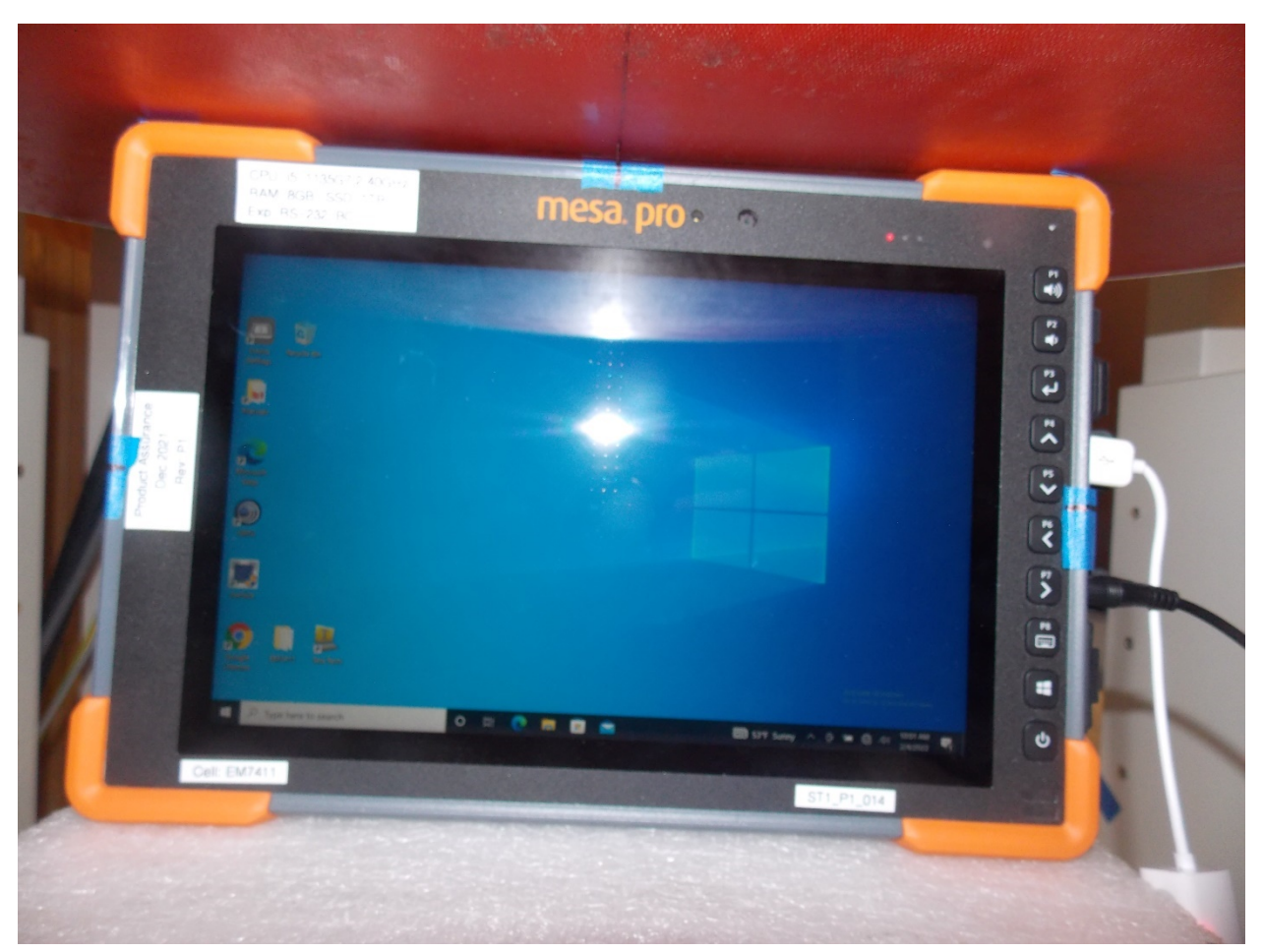
Test Position Top 0 mm Gap

Note: Cables are removed prior to testing.