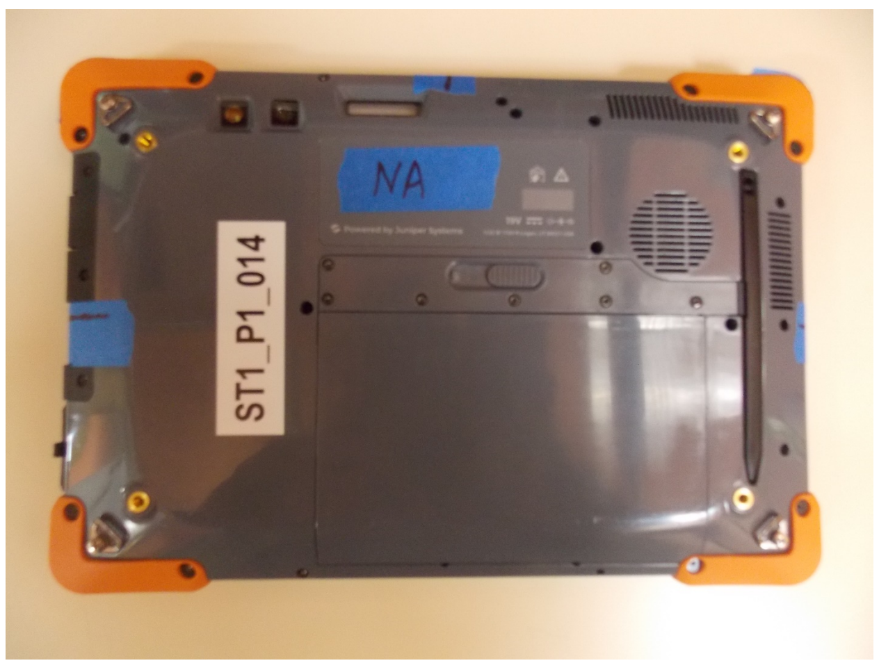
Back of Device