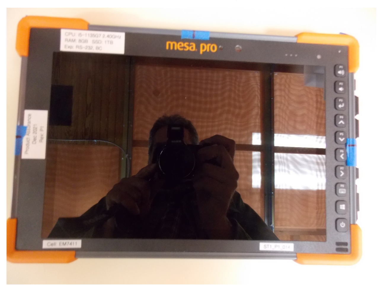
Front of Device