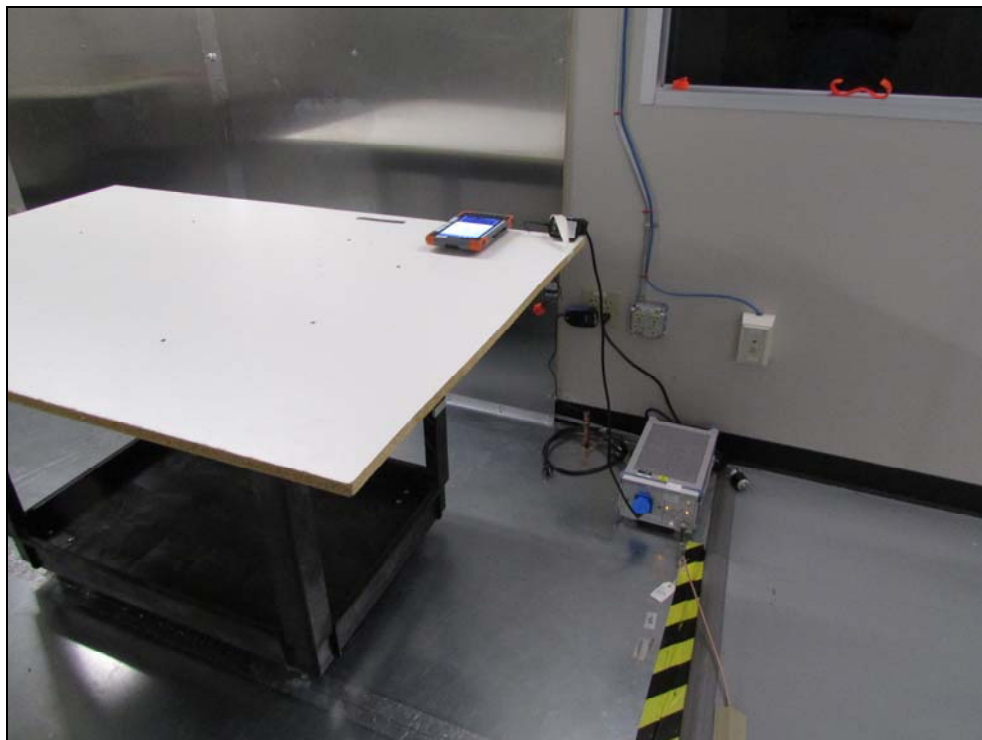
Figure 2: Power Line Conducted Emissions - Front