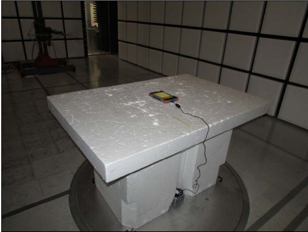
Figure 3: Radiated Spurious Emissions Below 1 GHz - Back