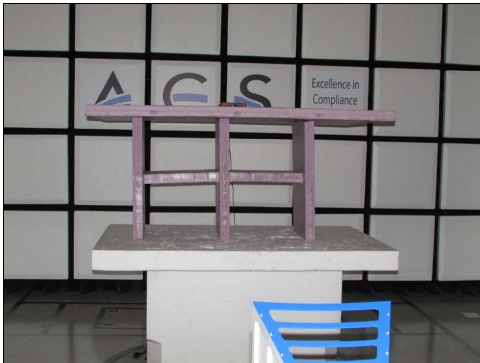
Figure 5: Radiated Spurious Emissions Above 1 GHz - Front