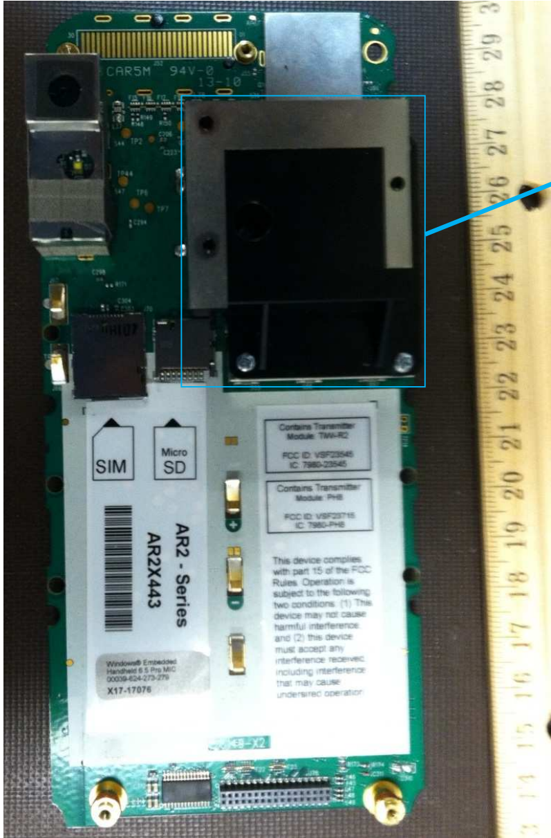
Antenna for PH8-P Radio Module (installed on top on the radio module mainboard