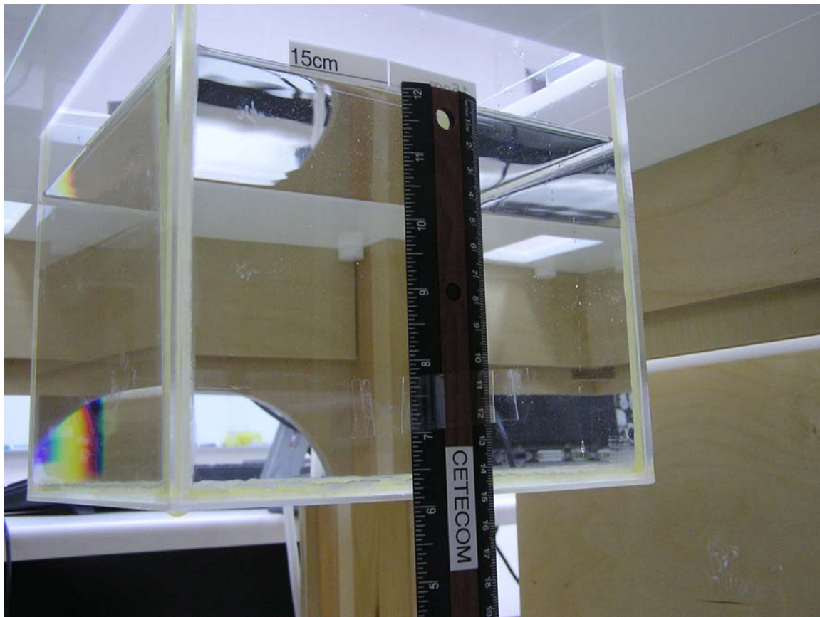
Photo 3. Photo to demonstrate 15 cm Z-axis flat phantom