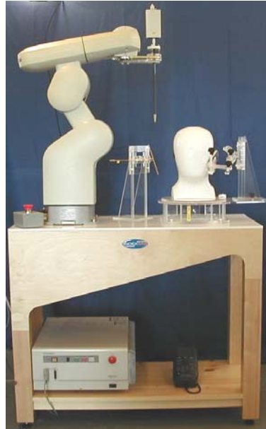
Figure 6: Principal components of the SAR measurement test bench

The major components of the test bench are shown in the picture above. A test set and dipole antenna control the handset via an air link and a low-mass phone holder can position the phone at either ear. Graduated scales are provided to set the phone in the 15 degree position. The upright phantom head holds approx. 7 litres of simulant liquid. The phantom is filled and emptied through a 45mm diameter penetration hole in the top of the head.