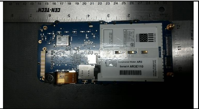
Main board – Rear view