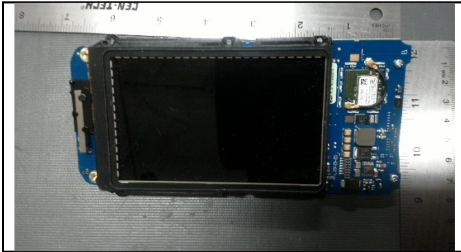
Main board – Front view