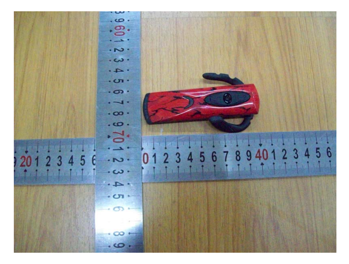
UP VIEW OF SAMPLE