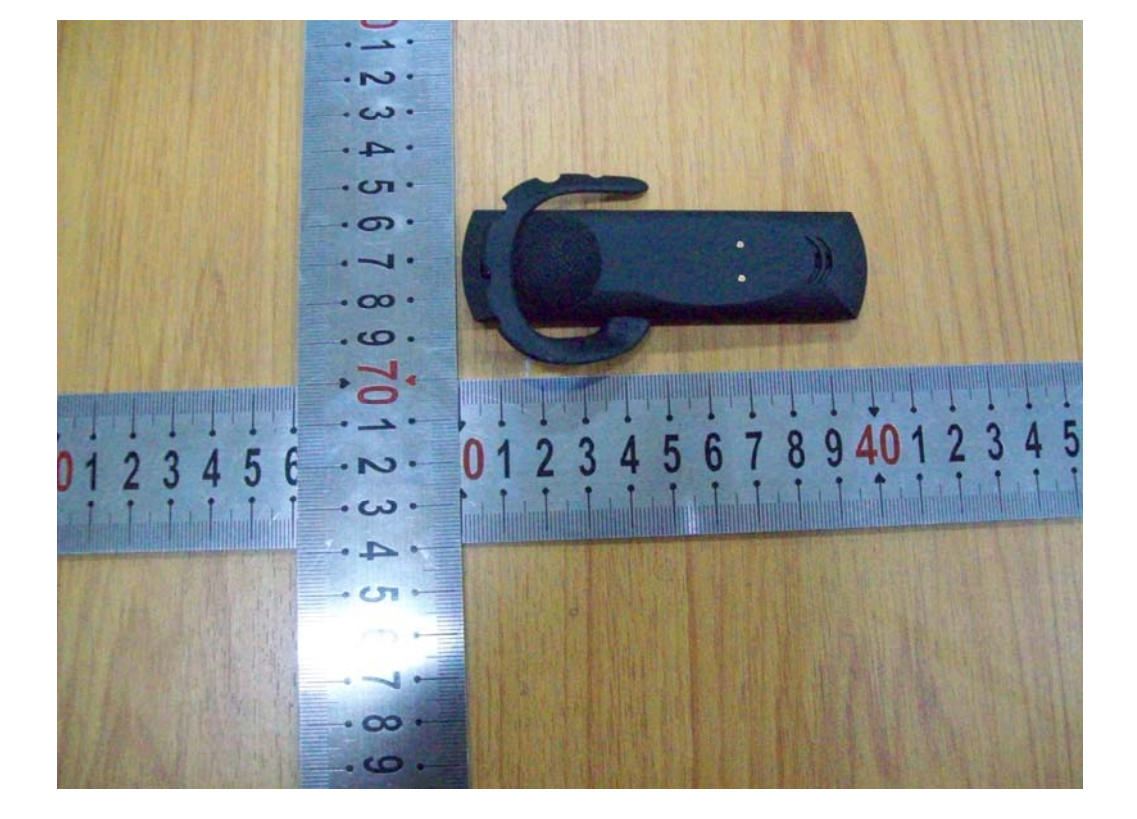
DOWN VIEW OF SAMPLE