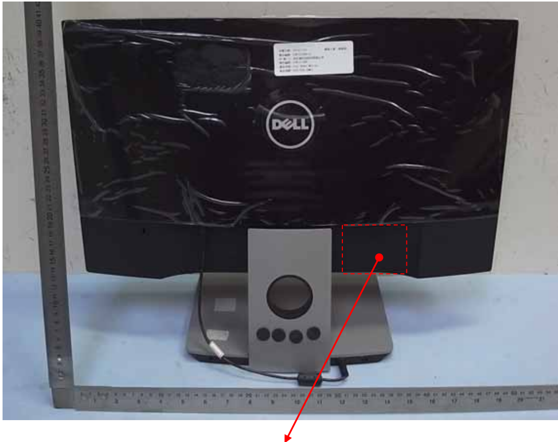
FCC ID/IC Label Placement Location