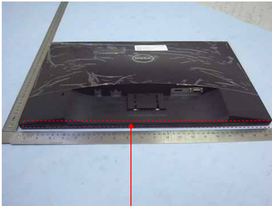
FCC ID/IC Label Placement Location