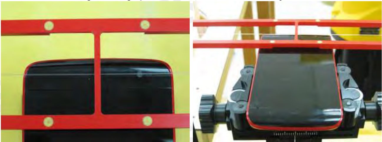
Fig.2 Receiver of mobile contact center of Arch.

Unless otherwise stated the results shown in this test report refer only to the sample(s) tested and such sample(s) are retained for 90 days only. 除非另有說明，此報告結果僅對測試之樣品負責，同時此樣品僅保留90天。本報告未經本公司書面許可，不可部份複製。