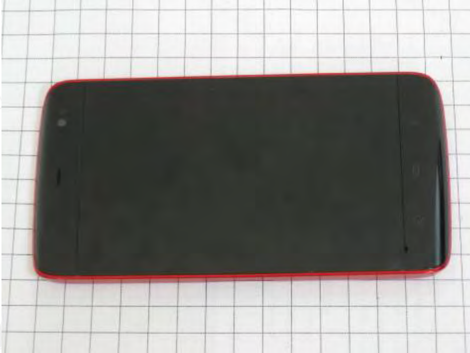
Fig.3 Front view of device