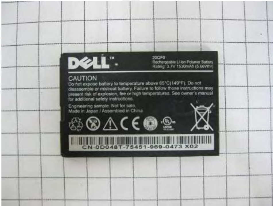
Fig.5 Front view of Battery