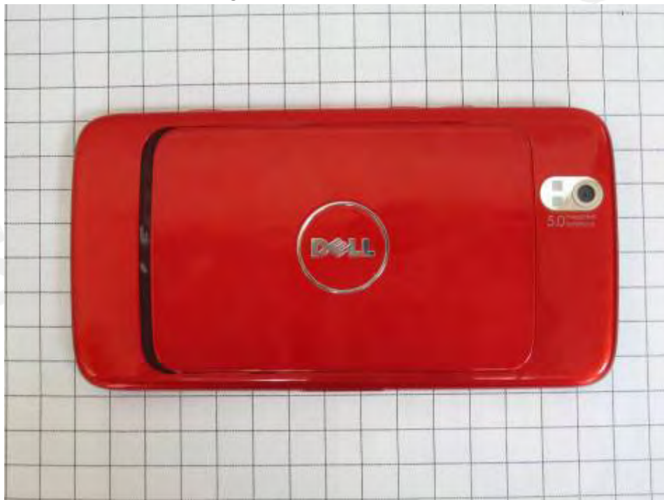
Fig.4 Back view of device

Unless otherwise stated the results shown in this test report refer only to the sample(s) tested and such sample(s) are retained for 90 days only. 除非另有說明，此報告結果僅對測試之樣品負責，同時此樣品僅保留90天。本報告未經本公司書面許可，不可部份複製。