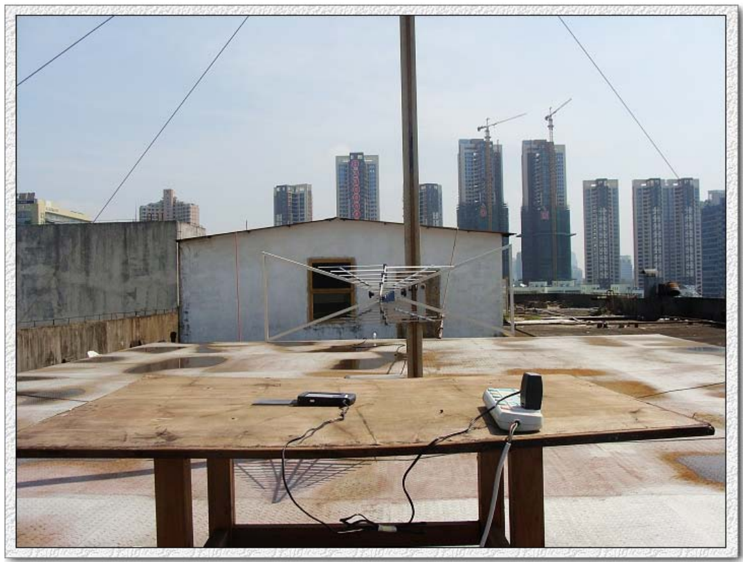
DSC-H10 F8.0 1/500s ISO125