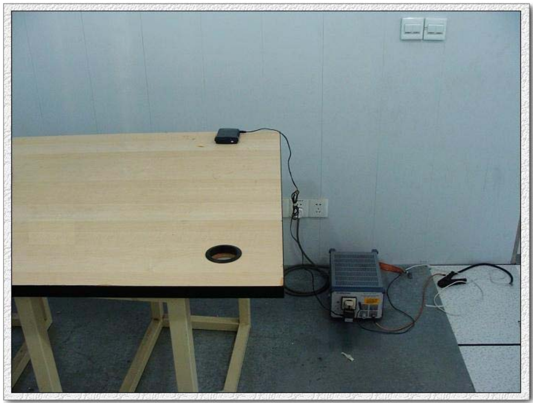
DSC-H10 F3.5 1/15s ISO 400