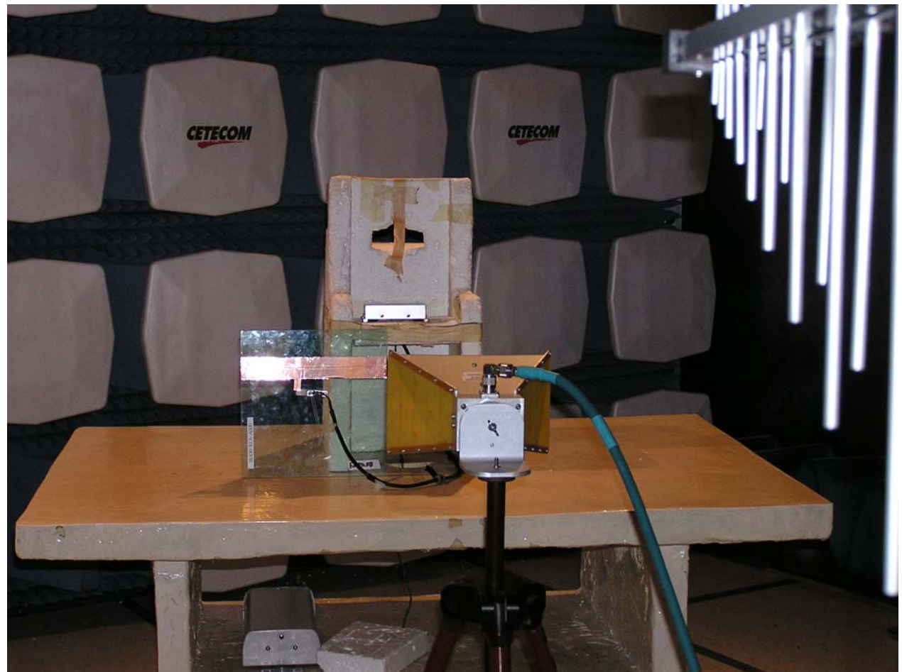
RADIATED EMISSIONS - Front