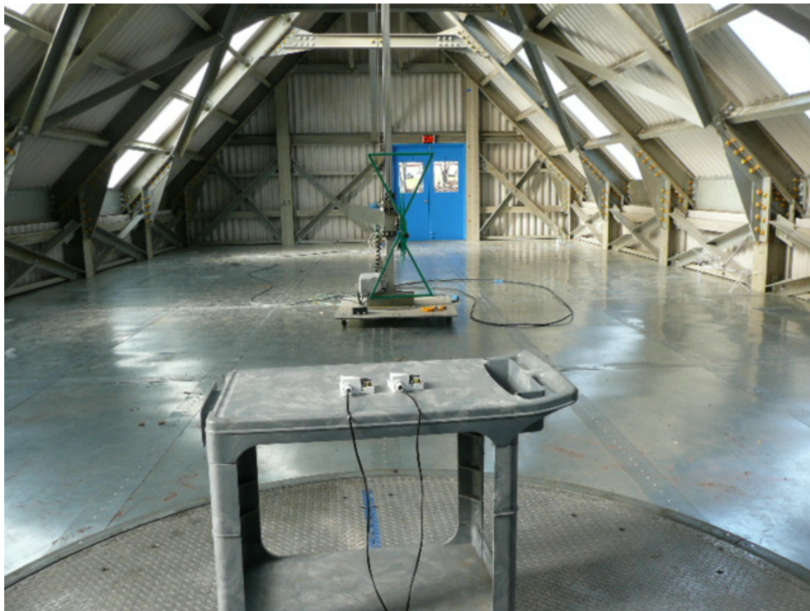
Figure 3 – Radiated Spurious Emission OATS Measurements