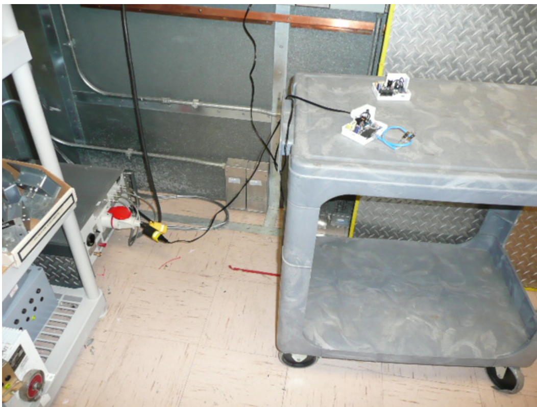
Figure 2 – Conducted Emissions Measurement