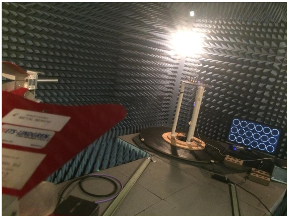
Photograph 4. Master, Test Setup