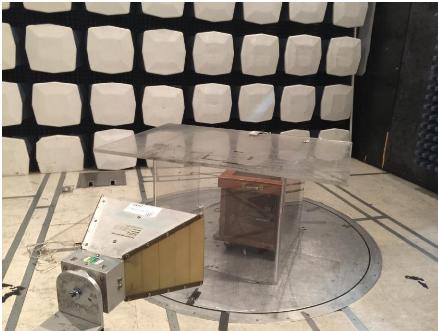
Photograph 2. Radiated Spurious Emissions, Test Setup, Above 1 GHz