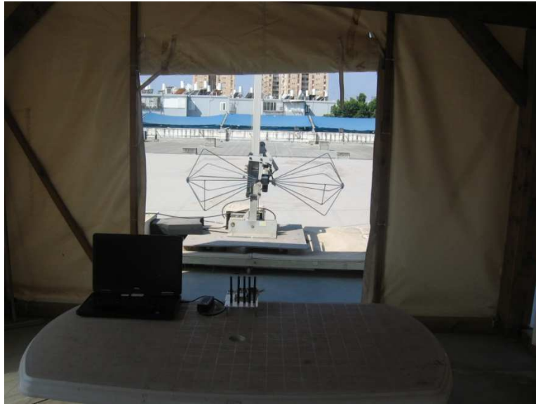
Figure 3: Radiated Emission 30MHz – 200MHz