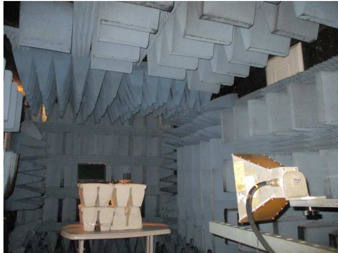
Figure 5: Radiated Emission 1GHz – 18GHz