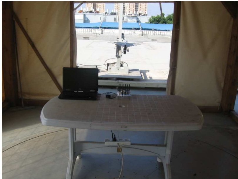
Figure 4: Radiated Emission 200MHz – 1GHz