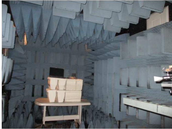
Figure 7: Radiated Emission 26.5GHz – 40GHz