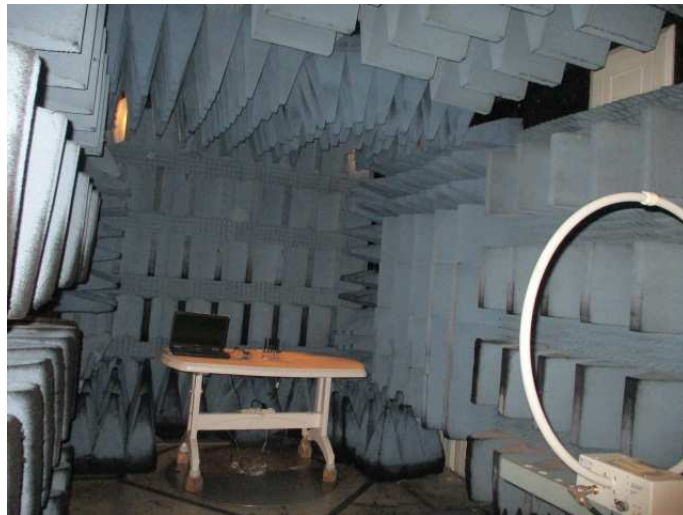
Figure 2: Radiated Emission 9kHz – 30MHz