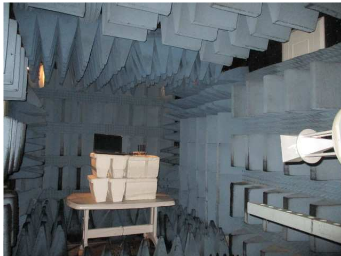
Figure 6: Radiated Emission 18GHz – 26.5GHz