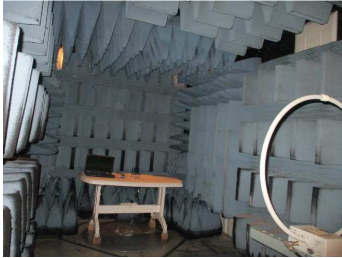
Figure 3. Radiated Emission Test, 0.009 30.0MHz

ISRAEL TESTING LABORATORIES Global Certifications You Can Trust