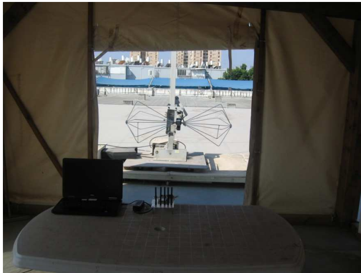
Figure 4. Radiated Emission Test, 30.0-200.0MHz