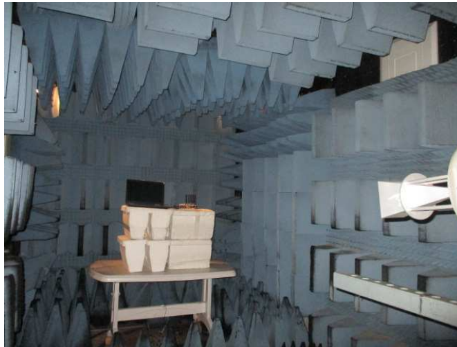
Figure 7. Radiated Emission Test, 18-26.5GHz

ISRAEL TESTING LABORATORIES Global Certifications You Can Trust