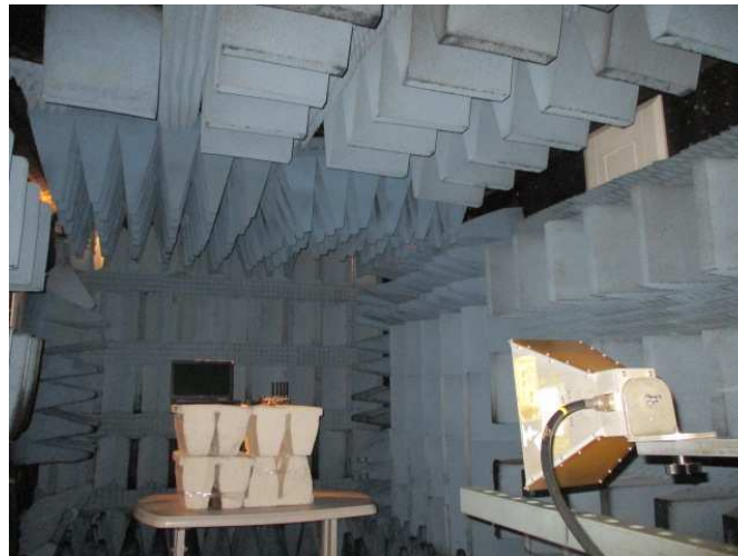
Figure 6. Radiated Emission Test, 1.0-18.0GHz