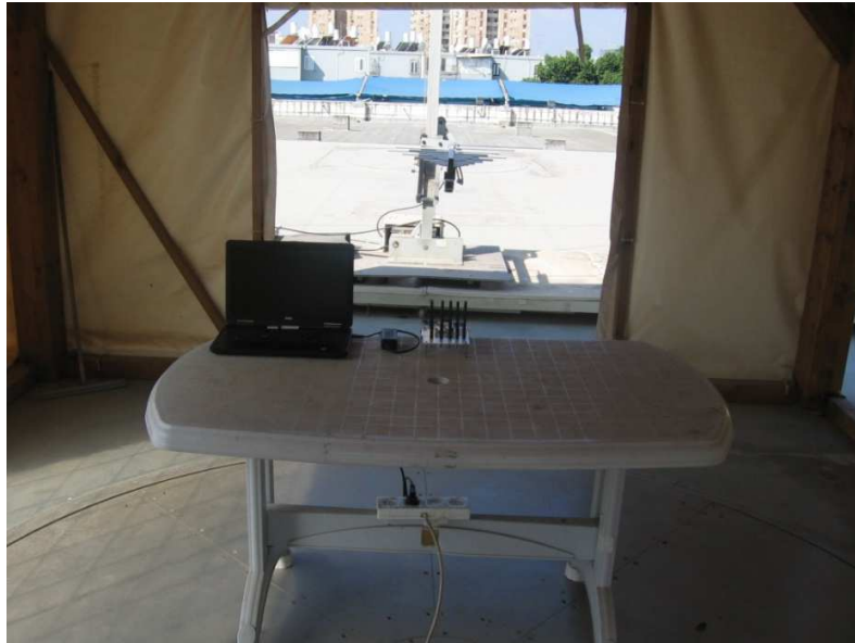
Figure 5. Radiated Emission Test, 200.0-1000.0MHz

ISRAEL TESTING LABORATORIES Global Certifications You Can Trust