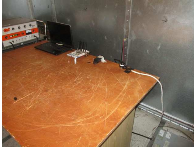
Figure 1. Conducted Emission AC Line Test