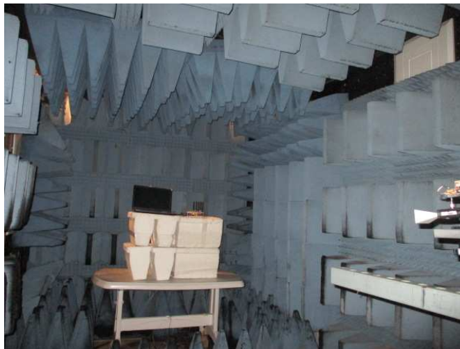
Figure 8. Radiated Emission Test, 26.5-40.0GHz