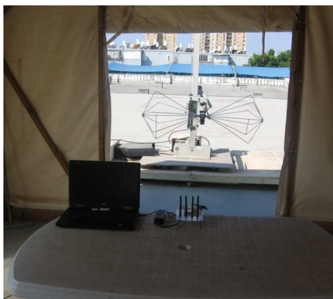
Figure 4: RE 30MHz – 200MHz - Test Setup