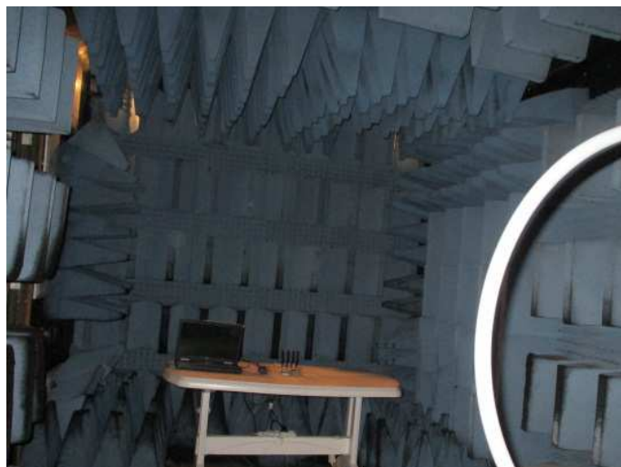
Figure 3: RE 9kHz – 30MHz - Test Setup