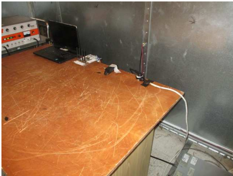
Figure 2: AC Line Conducted Emission - Test Setup