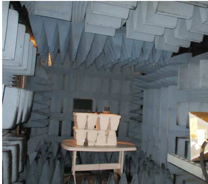
Figure 6: RE 1GHz – 18GHz - Test Setup