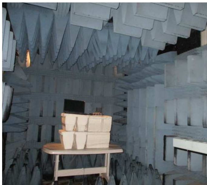
Figure 8: RE 26.5GHz – 40GHz - Test Setup