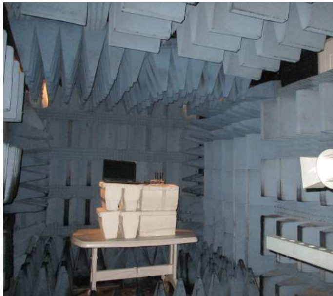
Figure 7: RE 18GHz – 26.5GHz - Test Setup