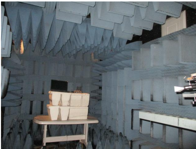
Figure 8. Radiated Emission Test, 26.5-40.0GHz