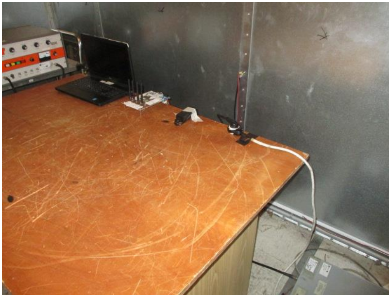
Figure 1. Conducted Emission AC Line Test