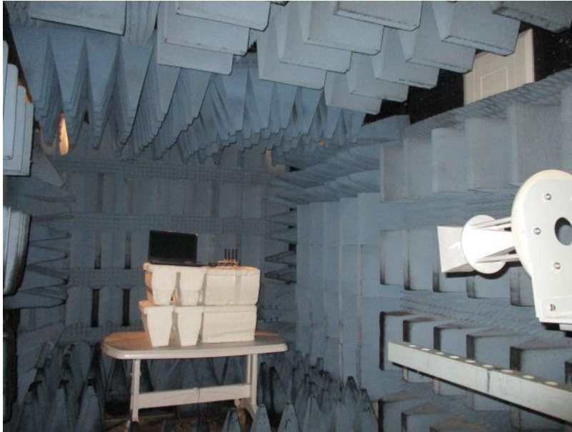
Figure 7. Radiated Emission Test, 18-26.5GHz