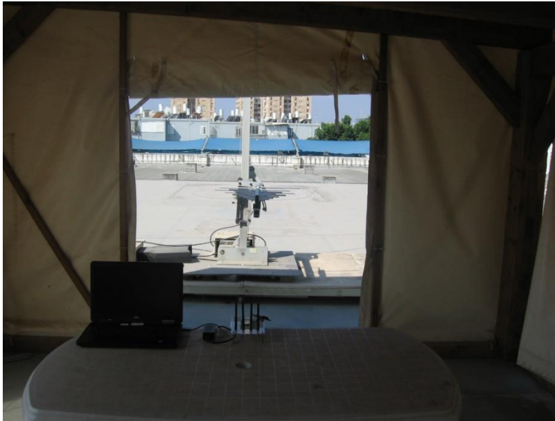
Figure 5. Radiated Emission Test, 200.0-1000.0MHz