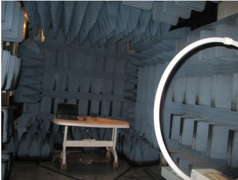
Figure 3. Radiated Emission Test,0.009 30.0MHz