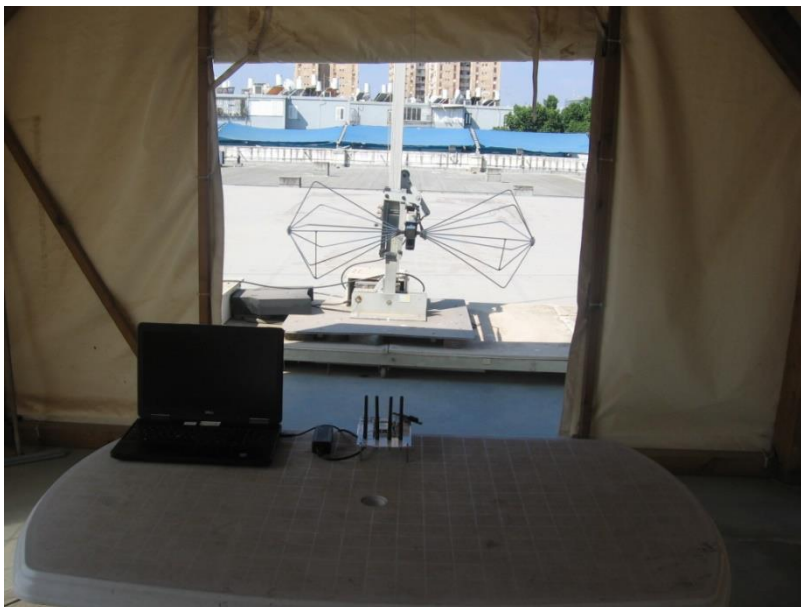
Figure 4. Radiated Emission Test, 30.0-200.0MHz