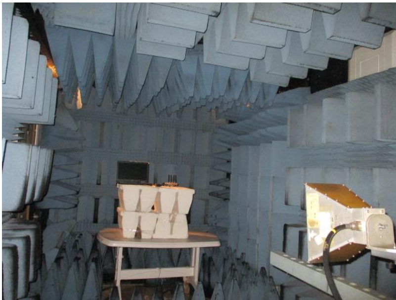
Figure 6. Radiated Emission Test, 1.0-18.0GHz