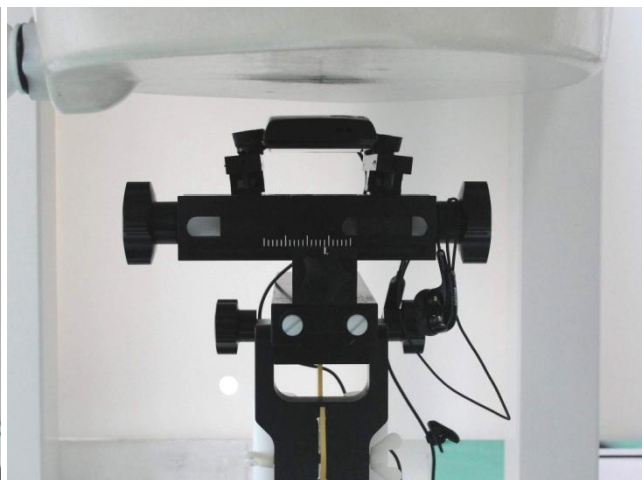
Bottom of the DUT with Phantom 1.5 cm Gap