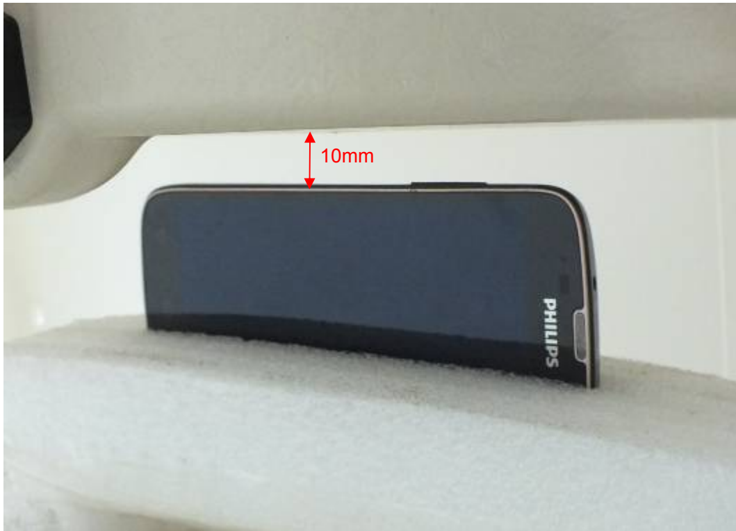
Picture 15: Left Edge, the distance from handset to the bottom of the Phantom is 10mm