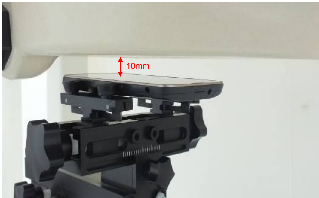
Picture 14: Front Side, the distance from handset to the bottom of the Phantom is 10mm