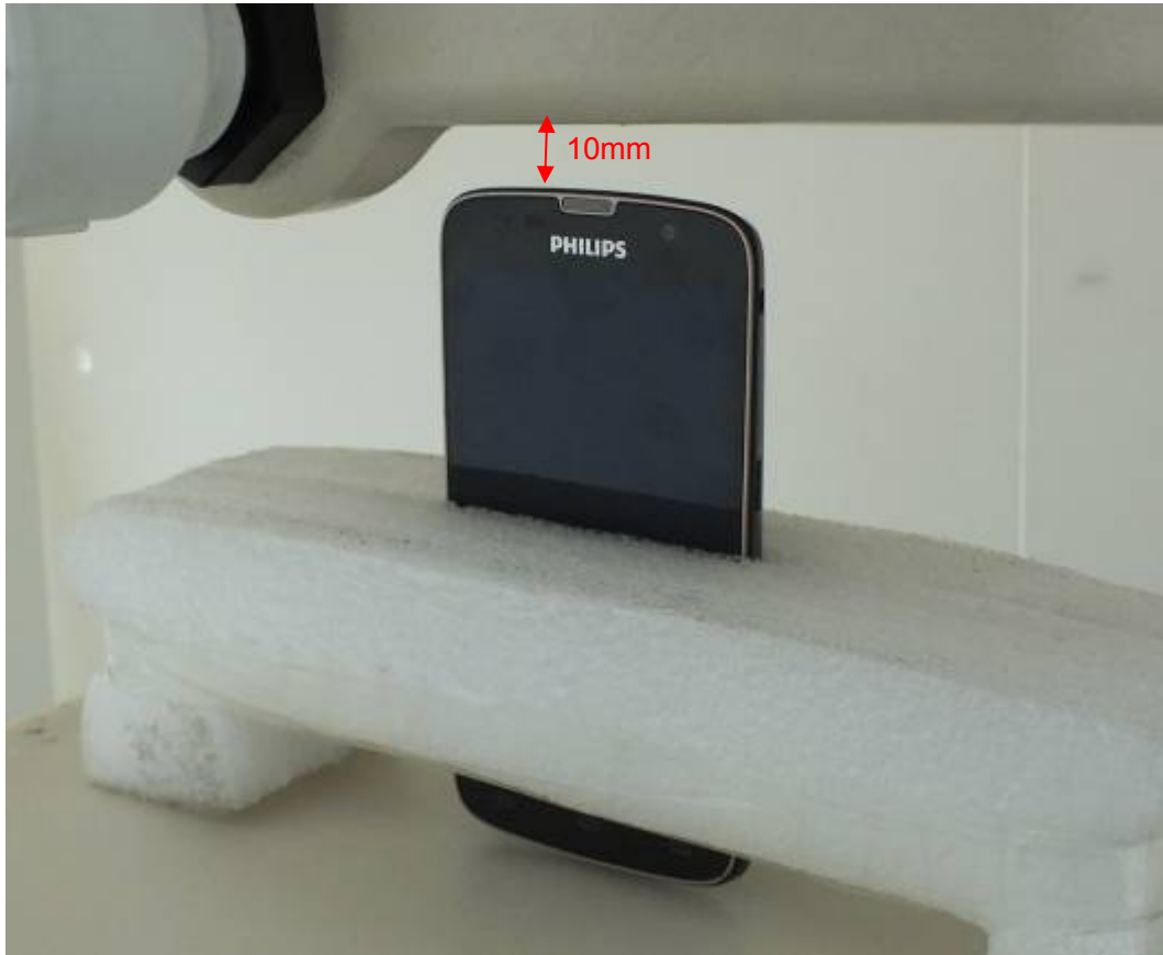
Picture 17: Top Edge, the distance from handset to the bottom of the Phantom is 10mm