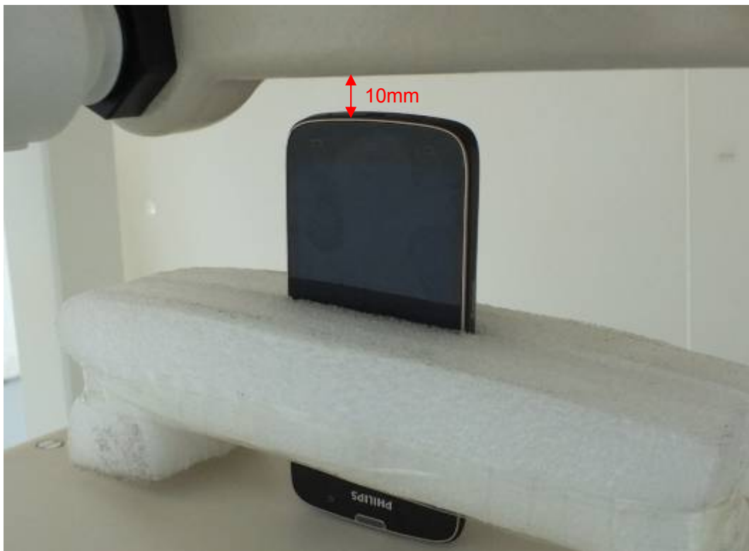
Picture 18: Bottom Edge, the distance from handset to the bottom of the Phantom is 10mm