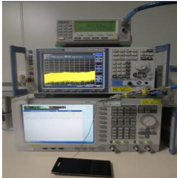
Spurious RF Conducted Emissions Test setup