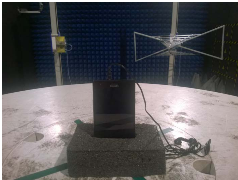
Radiated Spurious Emissions Test setup