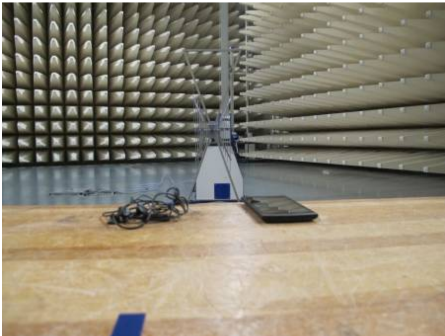
Spurious Radiated Emissions Test setup