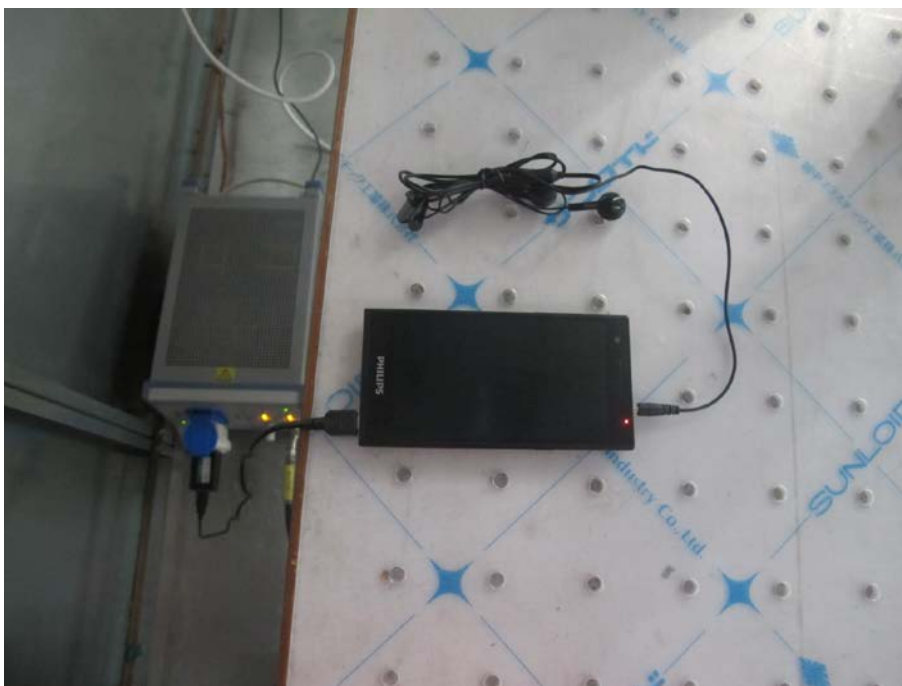
Conducted Emissions Test Setup (with charger)