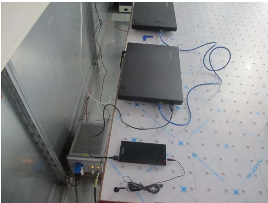
Conducted Emissions Test Setup (with laptop)