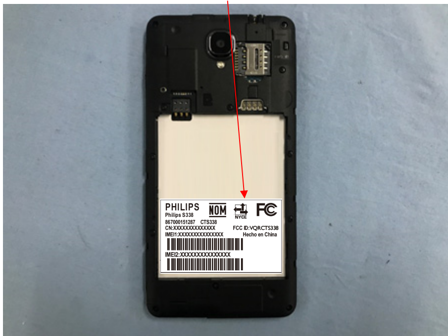
FCC Label Location