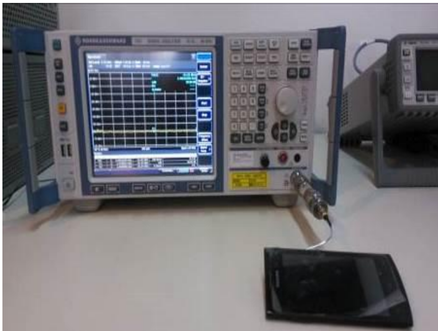
Spurious RF Conducted Emissions Test setup