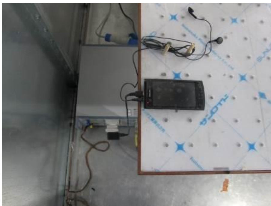
AC Power Line Conducted Emission Test setup