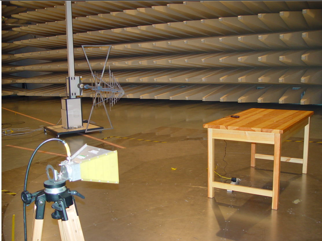
Pic 3 Radiated Emissions Test Setup