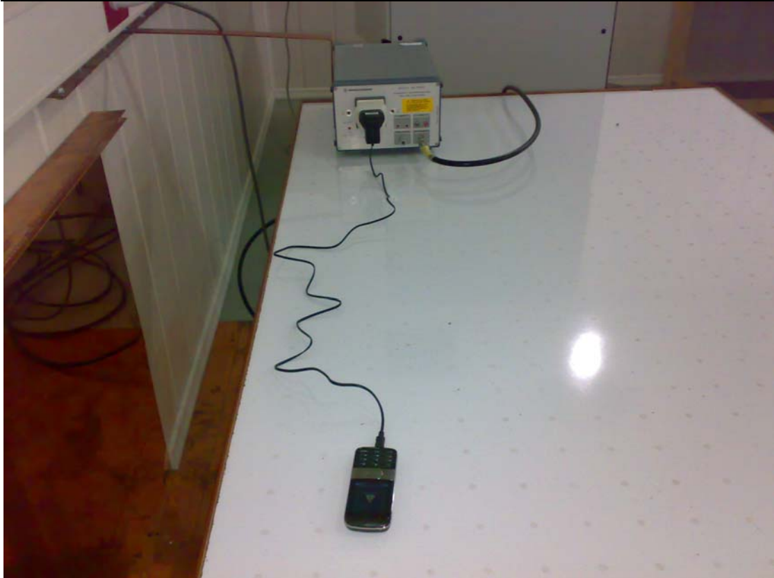
Pic 1 Conducted Emissions Test Setup