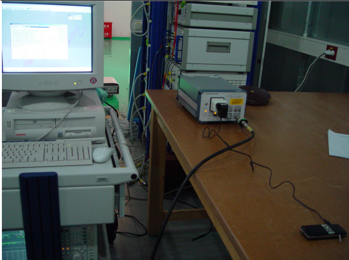
Pic 1 Conducted Emissions Test Setup