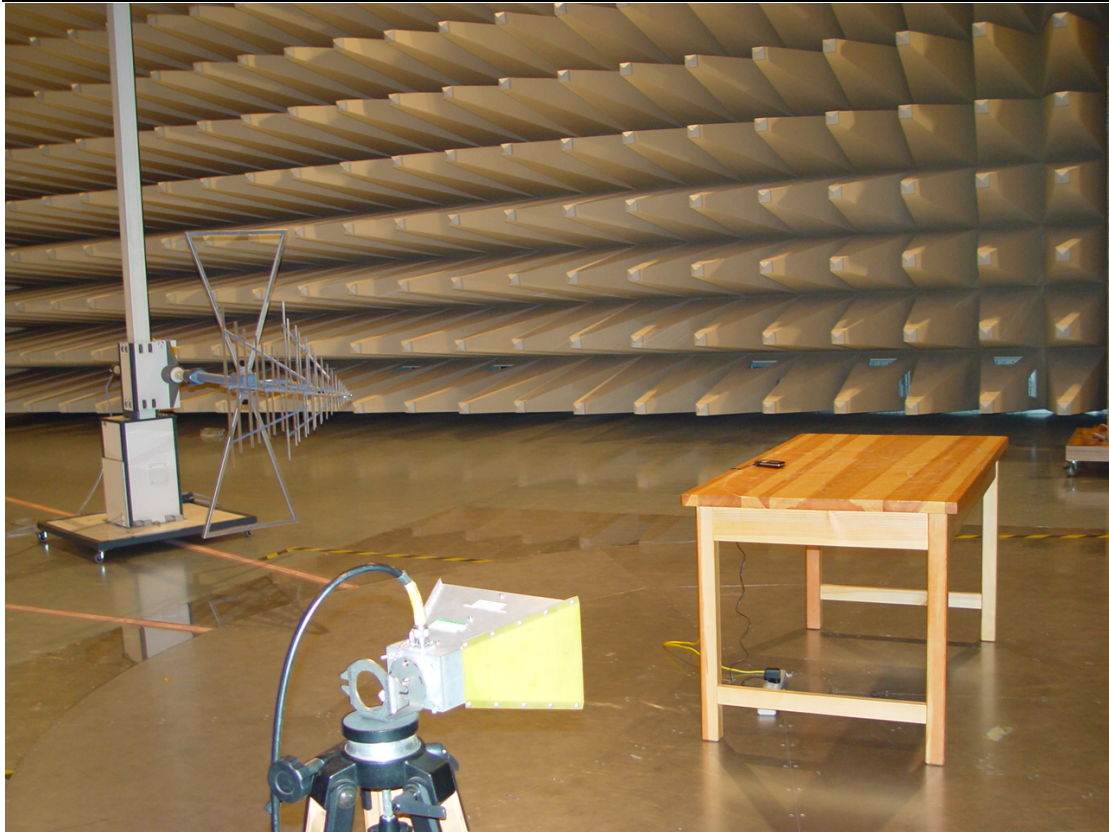
Pic 3 Radiated Emissions Test Setup