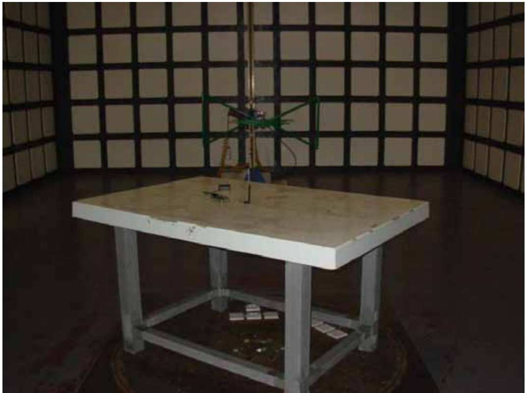
SETUP WITH MAXIMUM DETECTED EMISSION AT HORIZONTAL POLARIZATION (TRANSMITTING ANTENNA2 CH26)