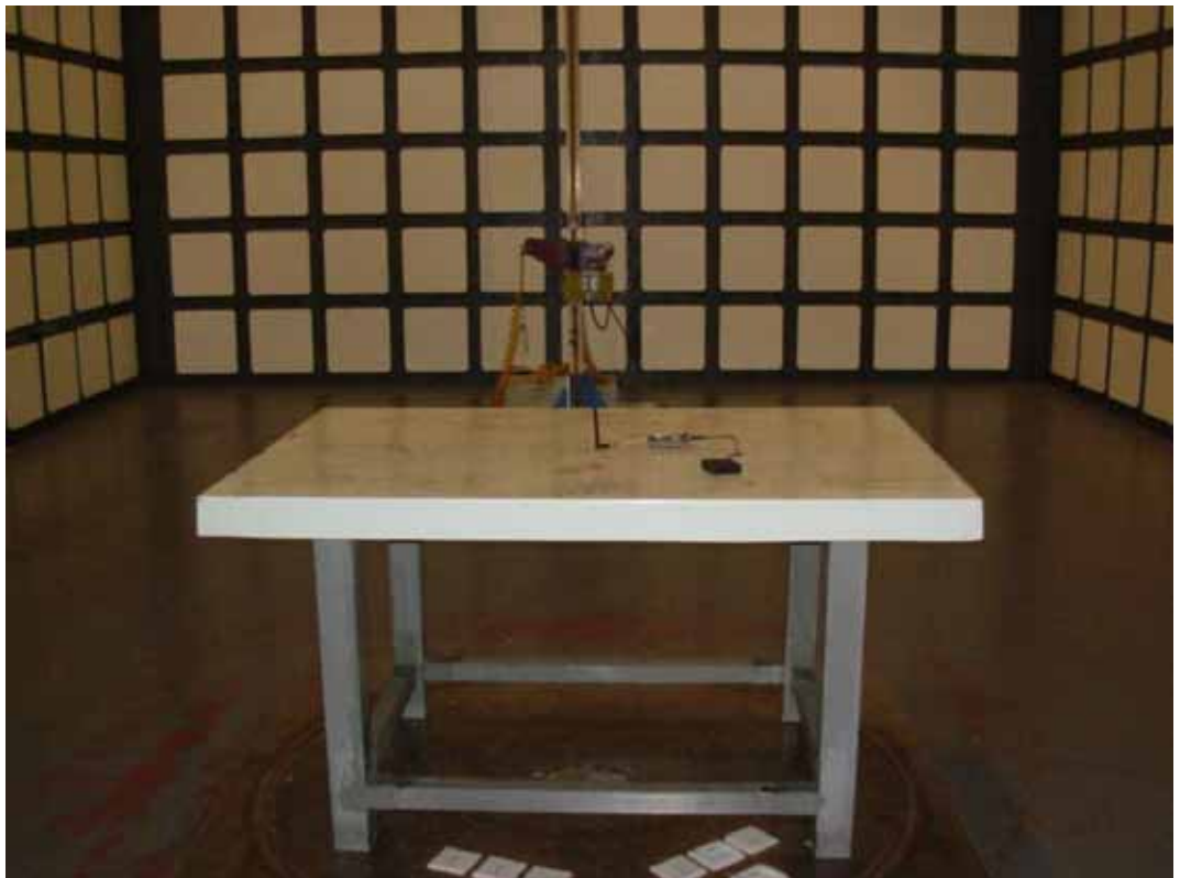
BACK VIEW OF RADIATED EMISSION TEST (ABOVE 1GHz)(ANTENNA 2)