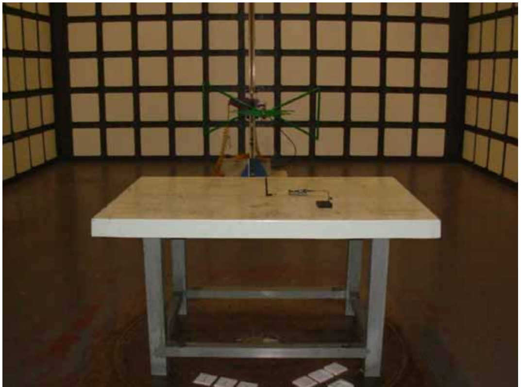
BACK VIEW OF RADIATED EMISSION TEST (BELOW 1GHz)(ANTENNA 2)