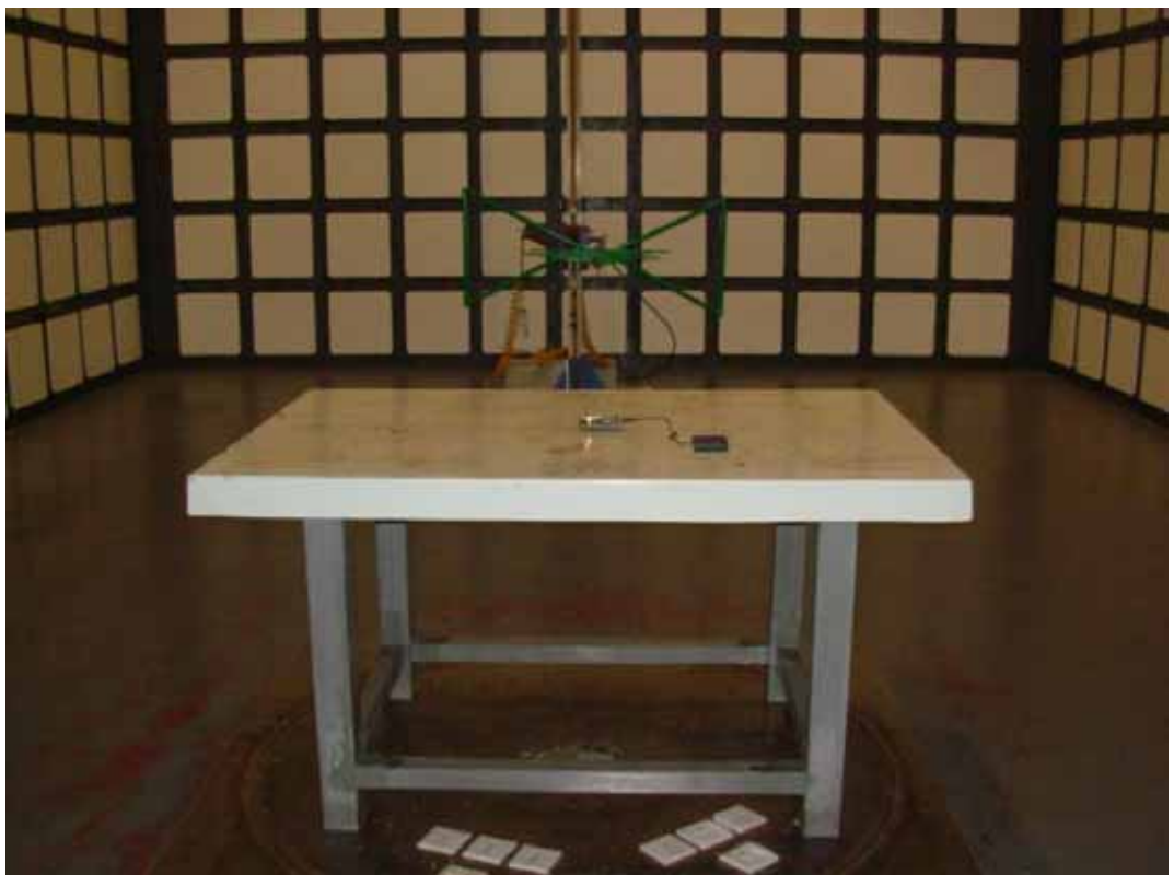
BACK VIEW OF RADIATED EMISSION TEST (BELOW 1GHz)(ANTENNA 1)