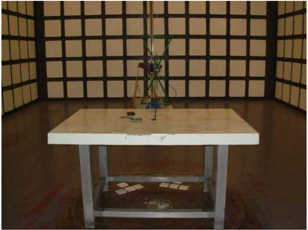
FRONT VIEW OF RADIATED EMISSION TEST (BELOW 1GHz)(ANTENNA 2)