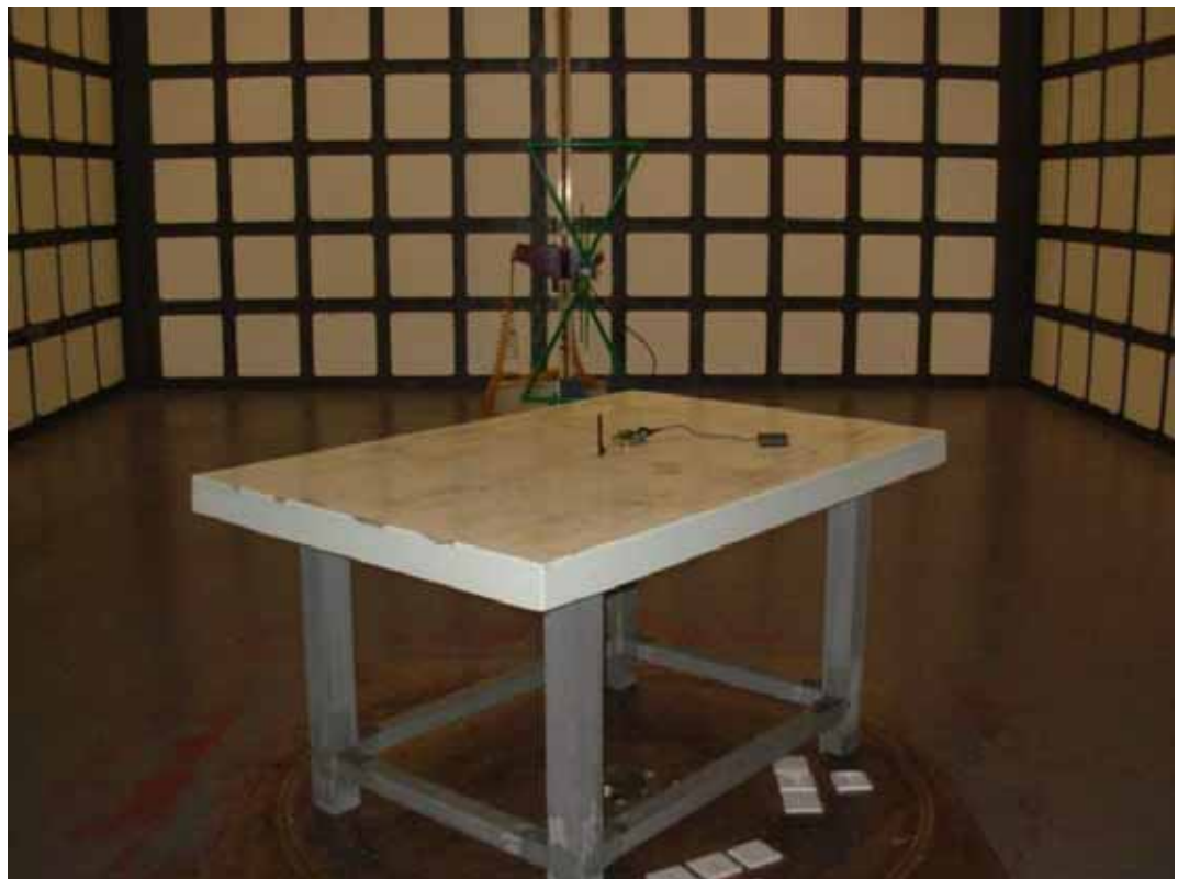
SETUP WITH MAXIMUM DETECTED EMISSION AT VERTICAL POLARIZATION (TRANSMITTING ANTENNA2 CH26)