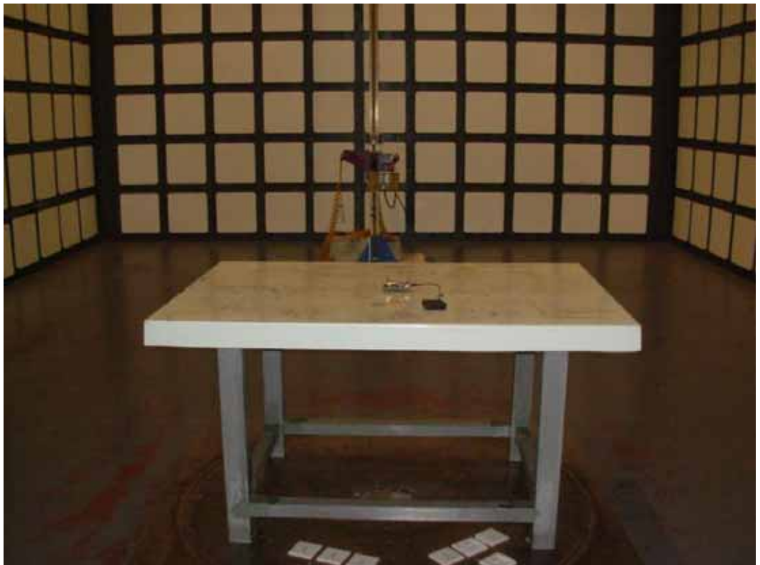
BACK VIEW OF RADIATED EMISSION TEST (ABOVE 1GHz)(ANTENNA 1)