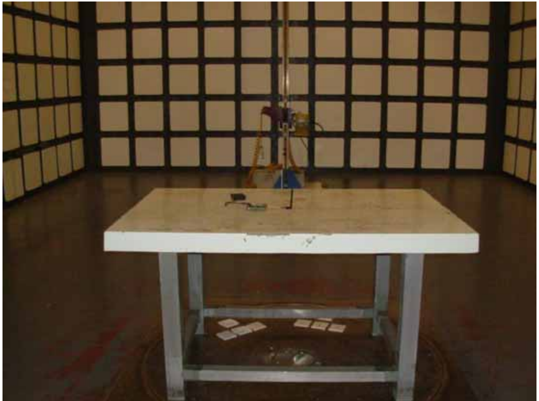
FRONT VIEW OF RADIATED EMISSION TEST (ABOVE 1GHz)(ANTENNA 2)