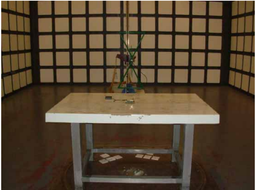
FRONT VIEW OF RADIATED EMISSION TEST (BELOW 1GHz)(ANTENNA 1)