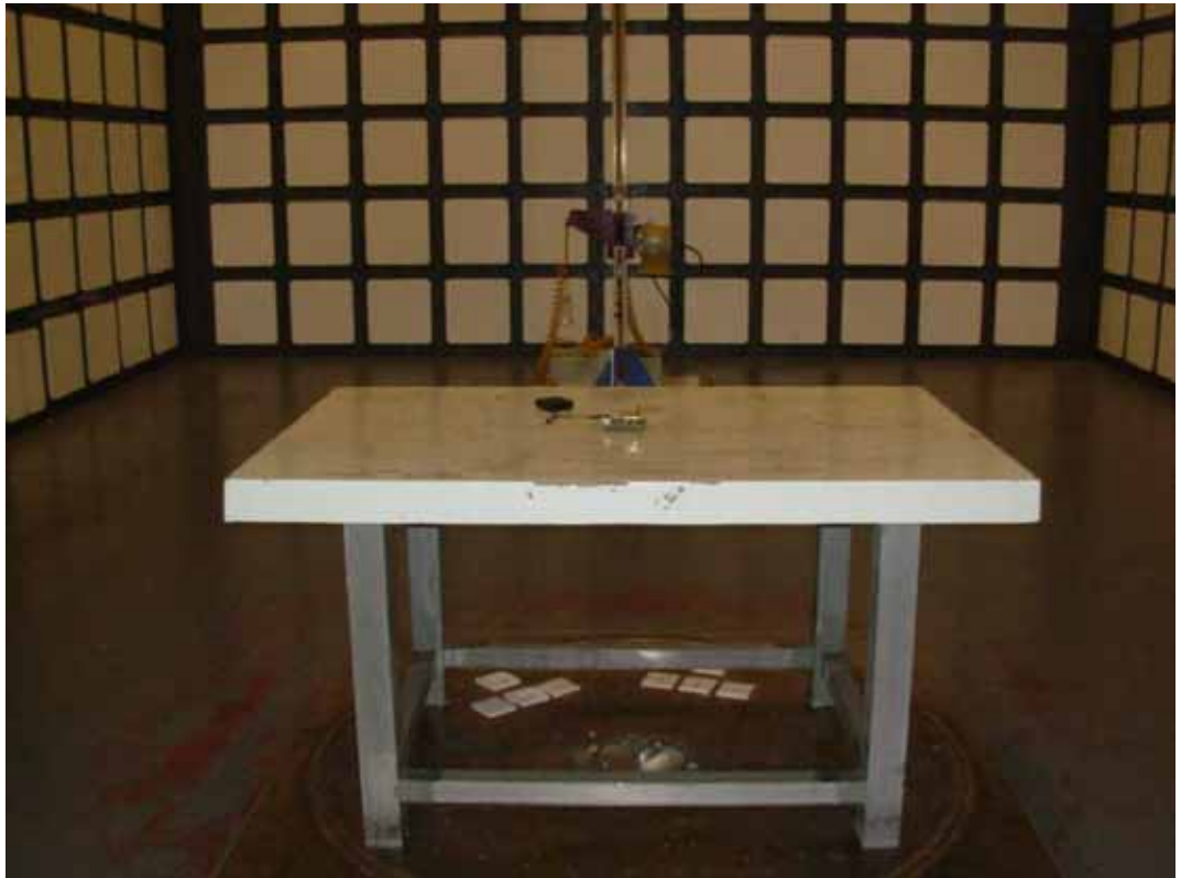
FRONT VIEW OF RADIATED EMISSION TEST (ABOVE 1GHz)(ANTENNA 1)