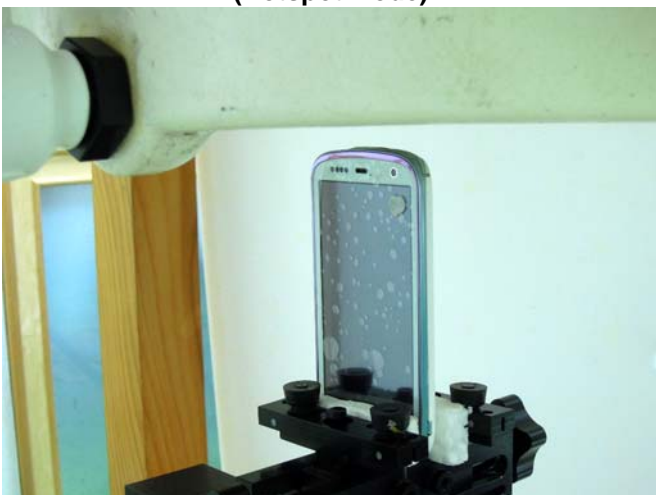
Top Side of EUT with 1 cm Gap (Hotspot Mode)