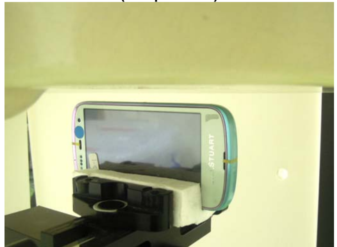
Right Side of EUT with 1 cm Gap (Hotspot Mode)