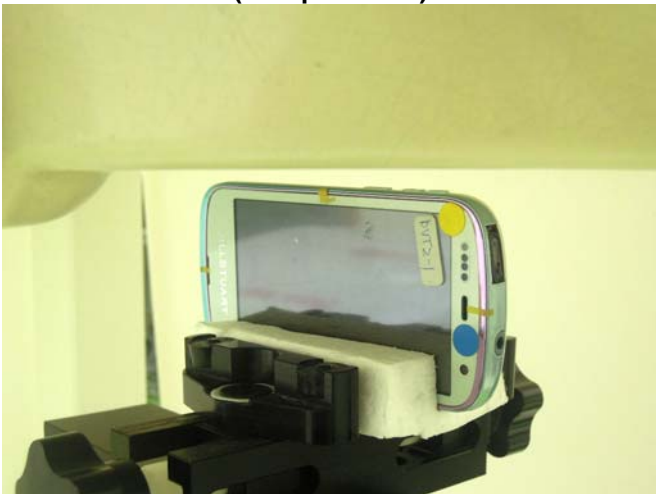
Left Side of EUT with 1 cm Gap (Hotspot Mode)