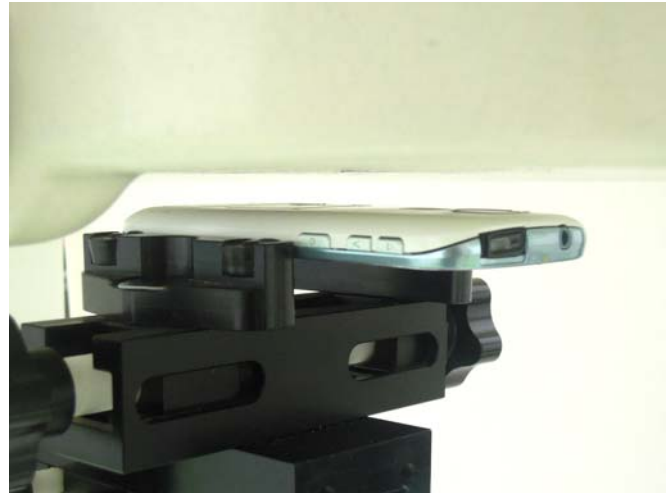
Rear Face of EUT with 1 cm Gap (Hotspot Mode)