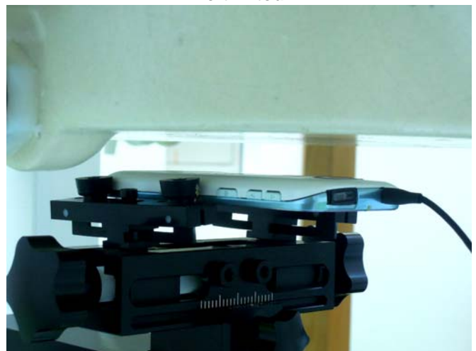
Rear Face of EUT with 1 cm Gap (Body-Worn Mode)