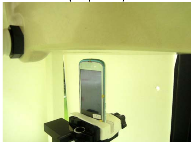
Bottom Side of EUT with 1 cm Gap (Hotspot Mode)