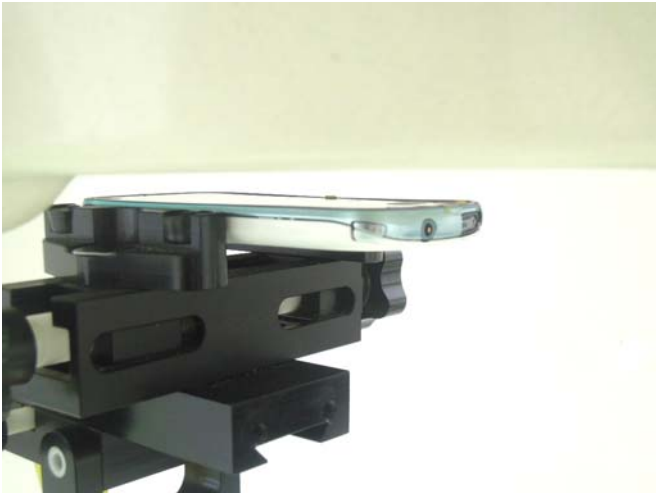
Front Face of EUT with 1 cm Gap (Hotspot Mode)