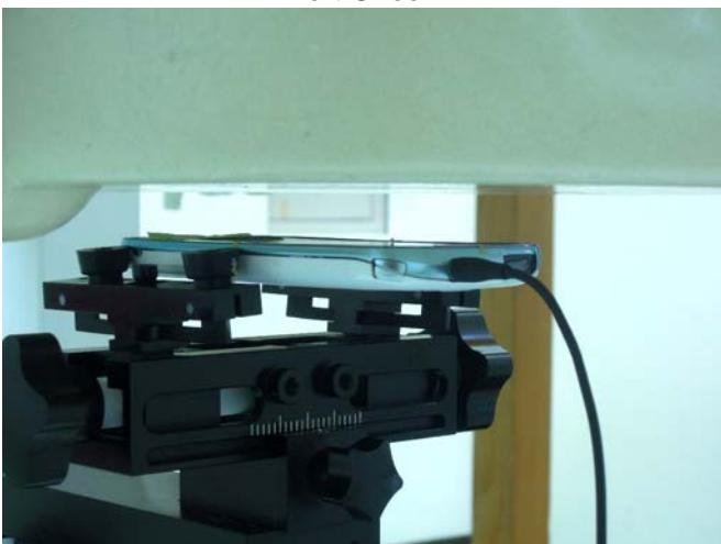
Front Face of EUT with 1 cm Gap (Body-Worn Mode)