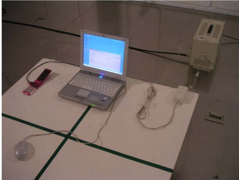
AC Power Line emission