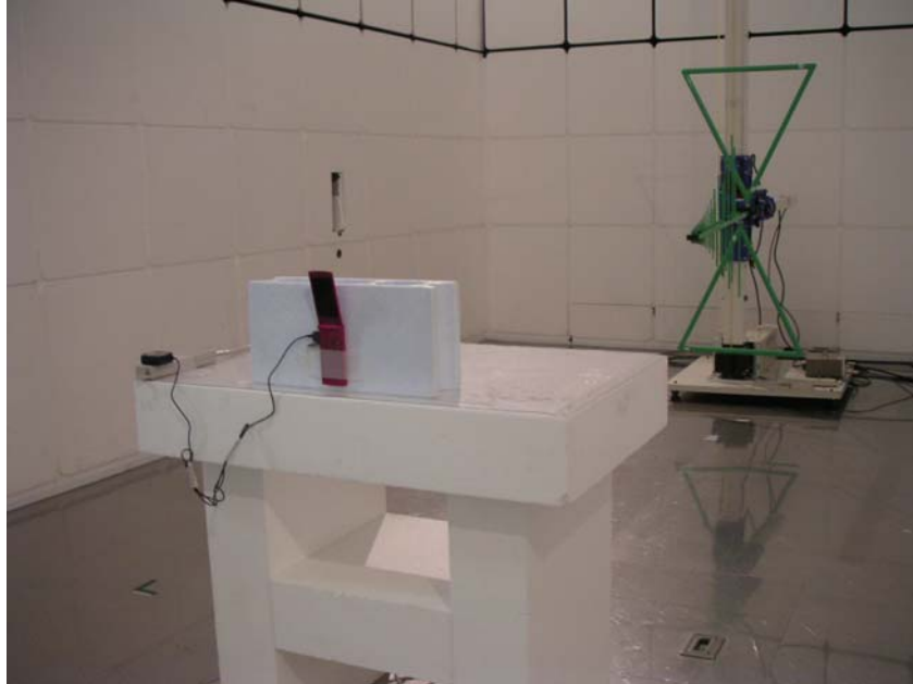
Radiated emission 1