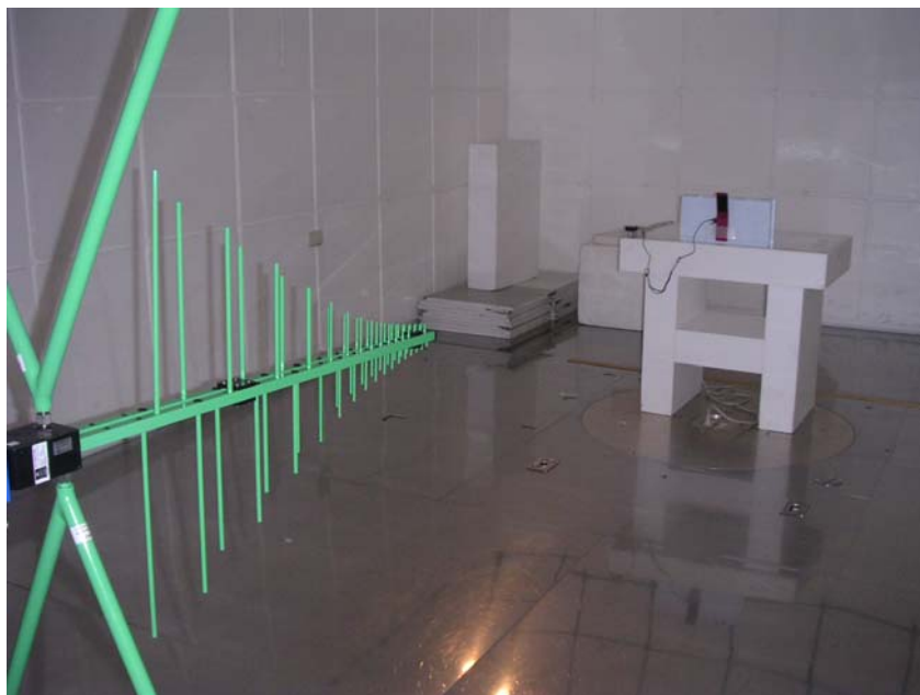
Radiated emission 2