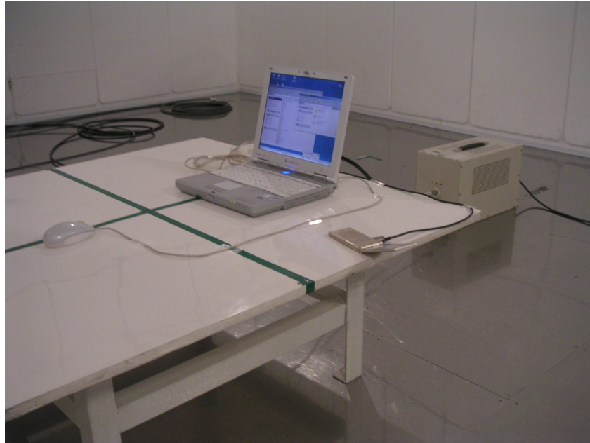
AC Power Line emission