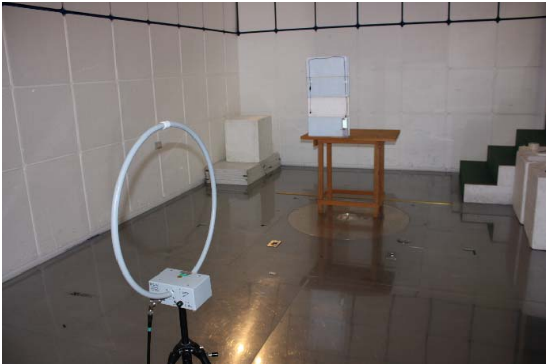
Below 30 MHz