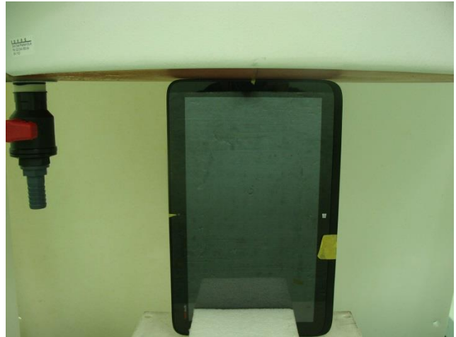
Edge2, Test Separation 0 cm