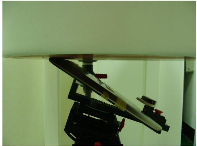
Curved surface of Edge1, Test Separation 0 cm