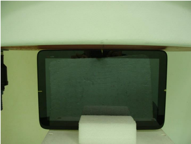
Edge1, Test Separation 0 cm