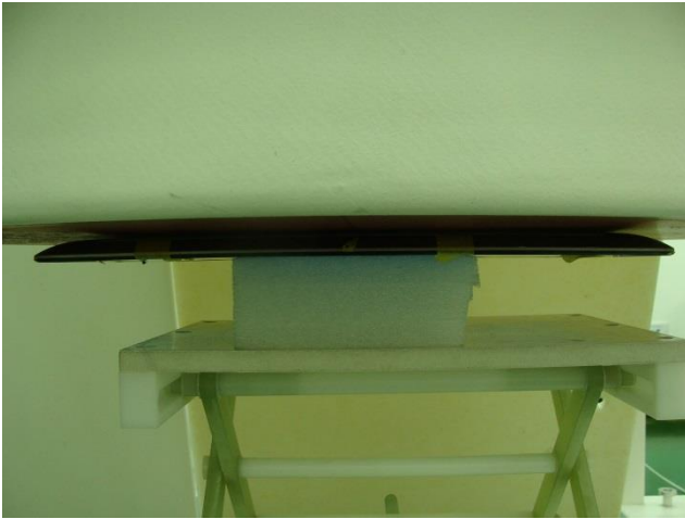
Bottom Face, Test Separation 0 cm