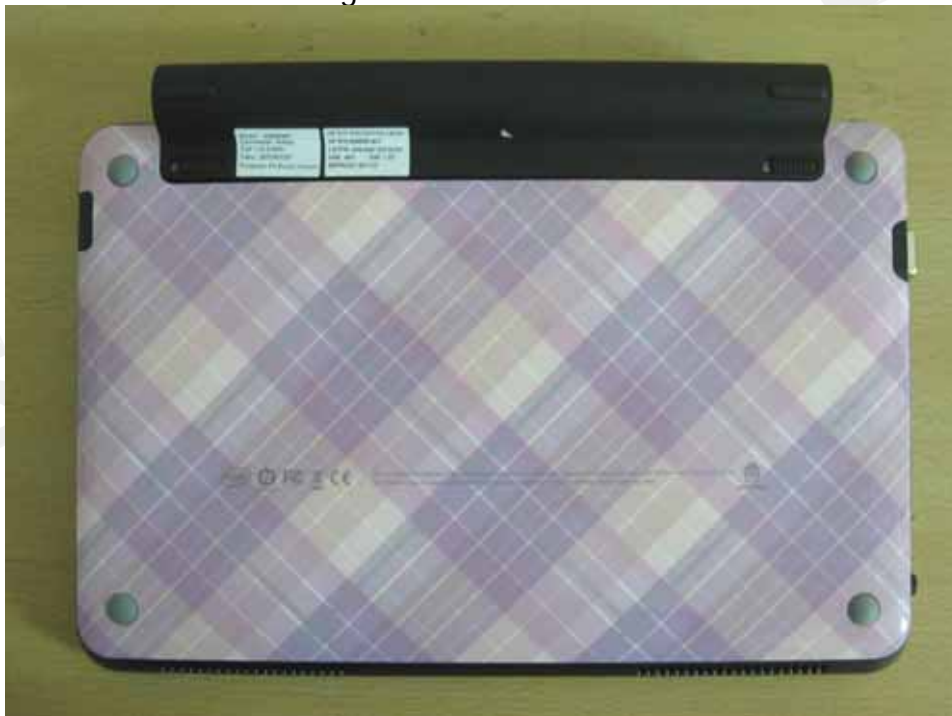
Fig.7 Back view of EUT

Unless otherwise stated the results shown in this test report refer only to the sample(s) tested and such sample(s) are retained for 90 days only. 除非另有說明，此報告結果僅對測試之樣品負責，同時此樣品僅保留90天。本報告未經本公司書面許可，不可部份複製。