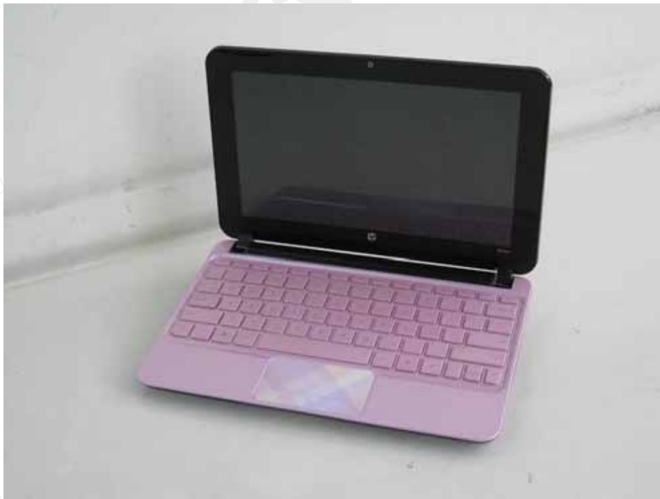
Fig.8 Fold up of EUT

Unless otherwise stated the results shown in this test report refer only to the sample(s) tested and such sample(s) are retained for 90 days only. 除非另有說明，此報告結果僅對測試之樣品負責，同時此樣品僅保留90天。本報告未經本公司書面許可，不可部份複製。