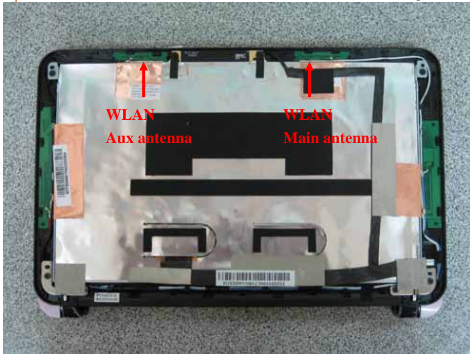
Fig.3 Antenna position of EUT