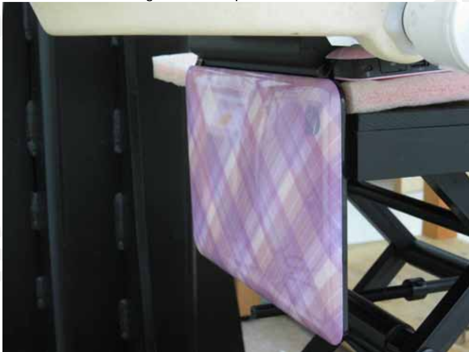
Fig.4 Lap-held mode

Unless otherwise stated the results shown in this test report refer only to the sample(s) tested and such sample(s) are retained for 90 days only. 除非另有說明，此報告結果僅對測試之樣品負責，同時此樣品僅保留90天。本報告未經本公司書面許可，不可部份複製。