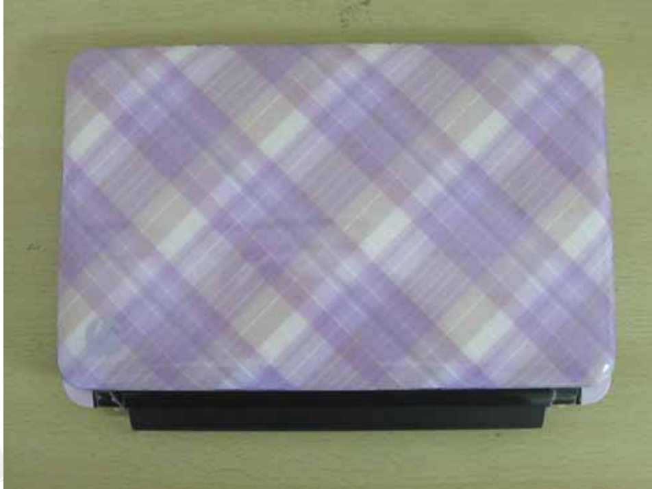
Fig.6 Front view of EUT