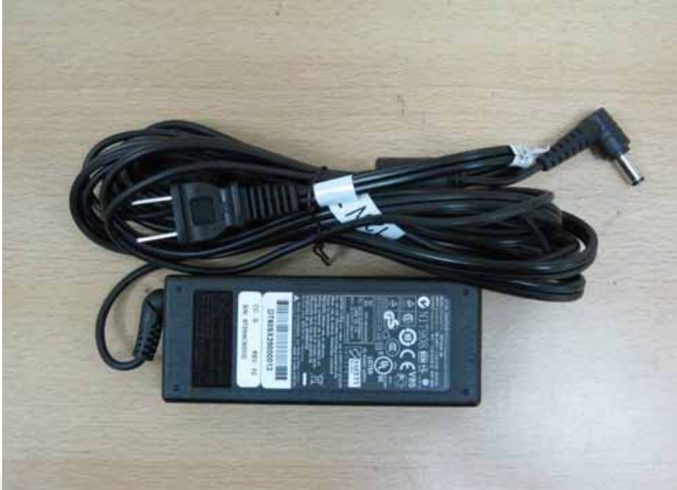
Fig.9 AC charger