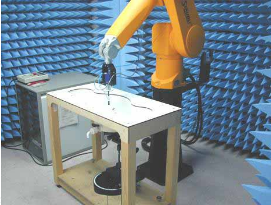
Fig.1 Photograph of the SAR measurement System