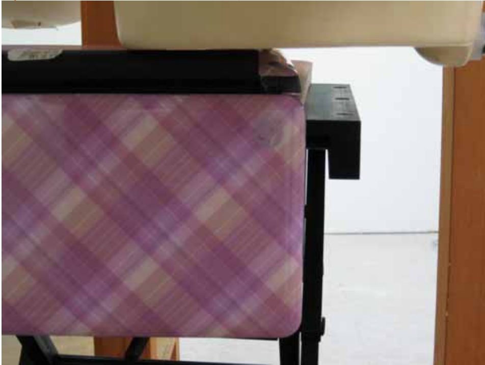
Fig.5 Lap-held mode

Unless otherwise stated the results shown in this test report refer only to the sample(s) tested and such sample(s) are retained for 90 days only. 除非另有說明，此報告結果僅對測試之樣品負責，同時此樣品僅保留90天。本報告未經本公司書面許可，不可部份複製。