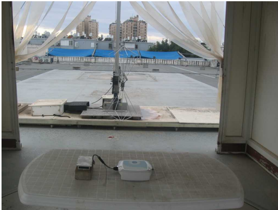
. Radiated Emission Test, 30-200MHz