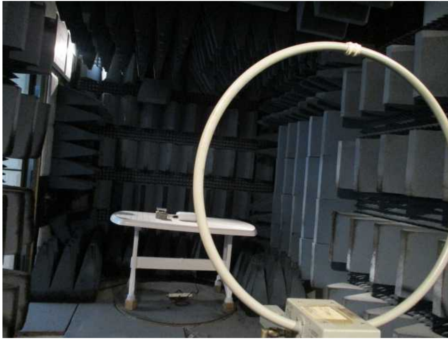
. Radiated Emission Test, 0.009-30MHz