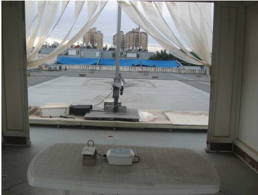
. Radiated Emission Test, 200-1000MHz