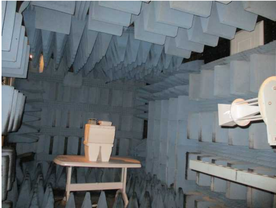
. Radiated Emission Test, 18-26.5GHz