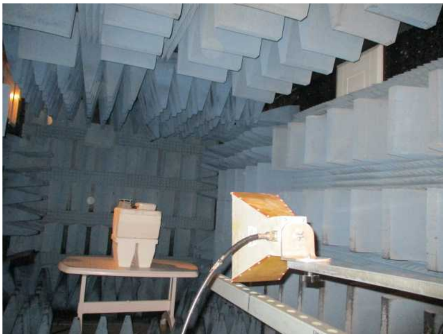
. Radiated Emission Test, 1-18GHz