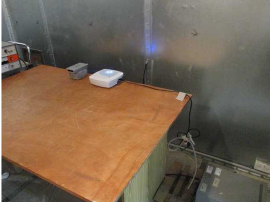
.Conducted Emission from AC Line Test