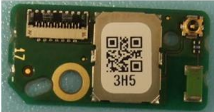
TOP View Photo