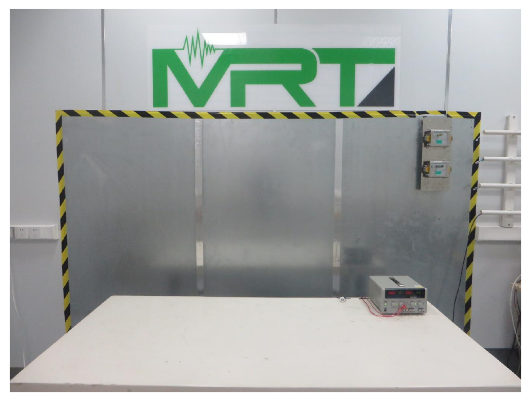
Test Mode 1 Description: Back view of Conducted Emission Test Setup for Power Port